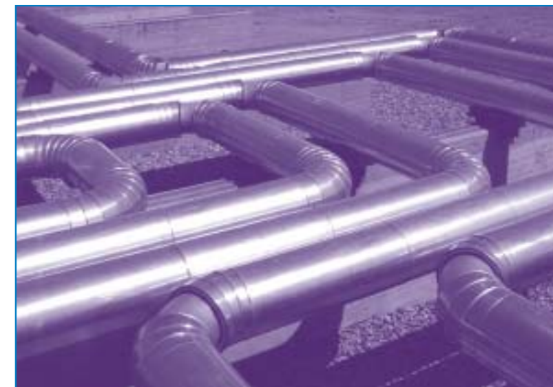
A natural gas pipeline.

United Nations Development Programme (UNDP) and the United Nations Environment Programme (UNEP) provide grant funding through the Global Environment Facility (GEF) to developing or transitional economies. < www.gefweb.org >