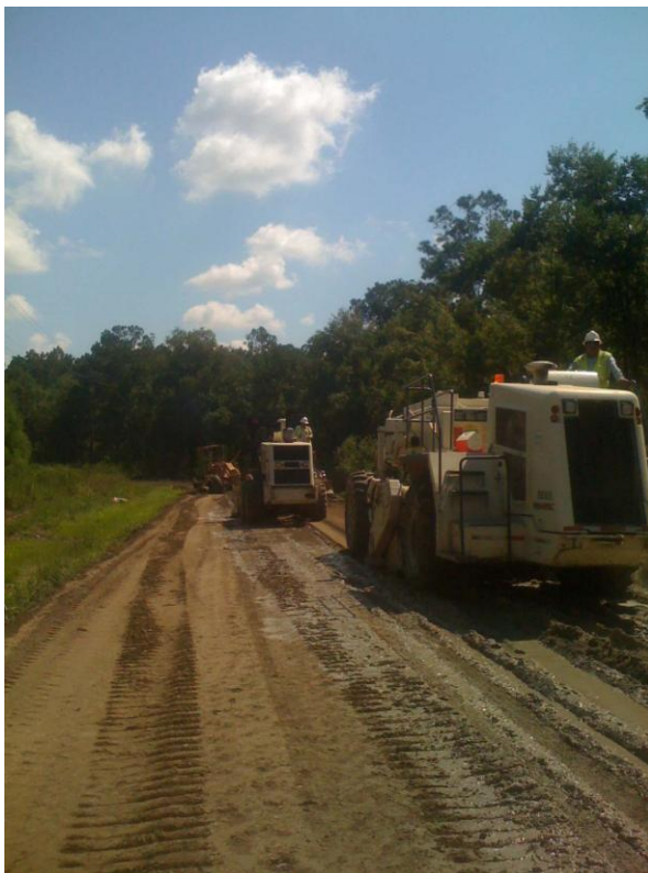
Resurfacing of Road in Progress

In 1988, CR 126 was excavated, back-filled, and re-built; residents were relocated during this period. The Remedial Investigations and Feasibility Studies (RI/FS) for both FPR and Source Control phases (operable units) were initiated in April 1988. The Texas Department on Environmental Quality (TCEQ) is the lead agency on cleanup of the FPR phase, while EPA has the lead on the Source Control.