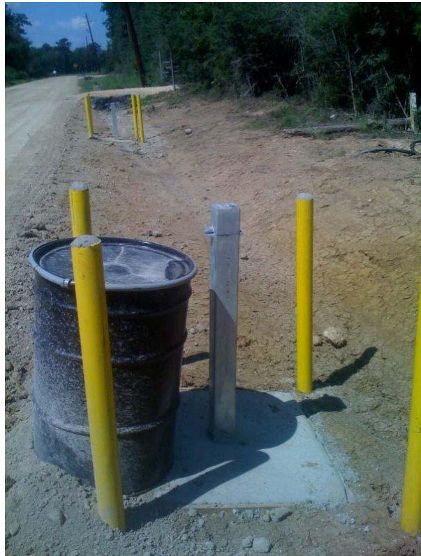
Monitoring Wells installed in MW-109 Area