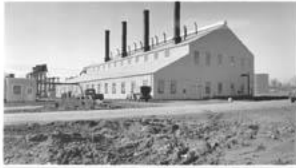
U.S. GOVERNMENT WAR DEPARTMENT UNION CARBIDE BUILDING Building No. 102 - Storage, loading equipment. December 22, 1944. Major G. W.