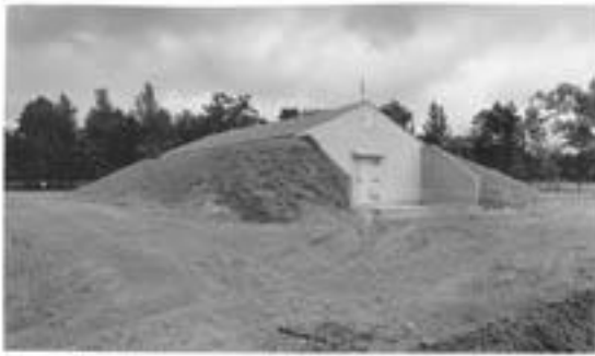
U.S. GOVERNMENT WAR DEPARTMENT UNION CARBIDE BUILDING Building No. 101 - Storage, loading equipment. September 22, 1944. Major G. W.