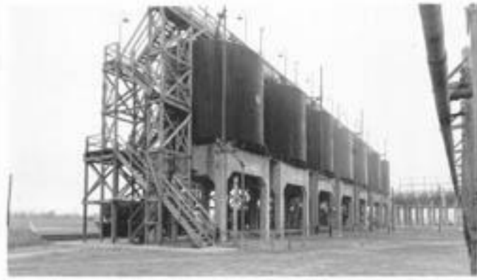
U.S. GOVERNMENT WAR DEPARTMENT UNION CARBIDE BUILDING Structure No. 315-B - 10,000 Gallon G. & S. Motor Storage Tank, loading equipment. February 1944. Major G. W.