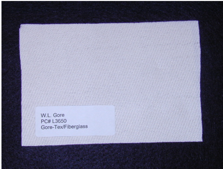
Figure 1. Photograph of W. L. Gore & Associates, Inc.’s L3650 filter fabric