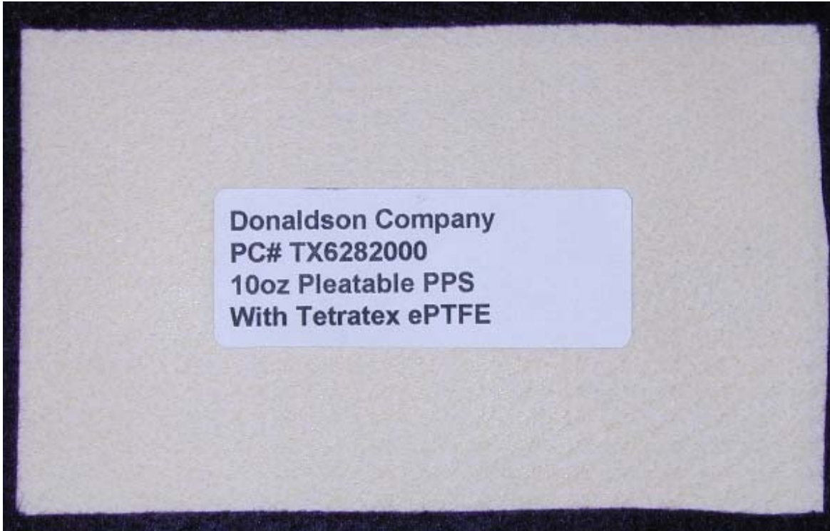
Figure 1. Photograph of Donaldson Company, Inc.'s 6282 Filtration Media