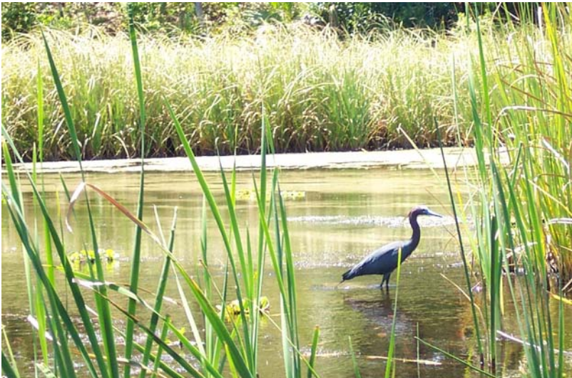
Little blue heron in Juniper Creek, Ocala National Forest, Florida.

Wetlands are among the Nation’s most important natural resources. They provide a variety of benefits, such as pollutant reduction/removal, flood protection, shoreline erosion control, carbon sequestration, and ground water recharge. As primary habitats for fish, waterfowl, and wildlife, they are economically important and provide numerous opportunities for education, recreation, and research.