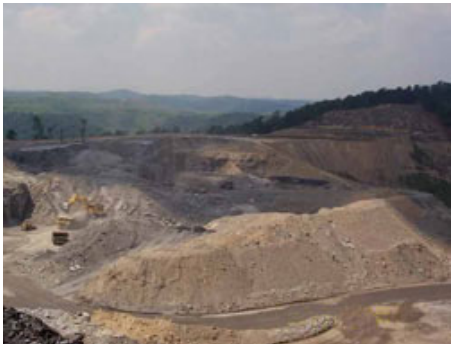
Fill from surface mining operations may be discharged into surface waters or wetlands.

With the 1972 passage of the CWA, the Federal Government began to regulate the discharge of dredged or fill material into navigable waters, including wetlands and other surface waters. Discharges of dredged or fill material occur most frequently from development activities (e.g., residential, commercial, or municipal), infrastructure improvements (e.g., highways, dams, and airports), mining projects, and nonexempt agricultural activities. The CWA gives EPA and the U.S. Army Corps of Engineers (Corps) the ability to take enforcement actions against those who violate §404. The Assistant Secretary of the Army for Civil Works oversees the Corps’ regulatory program.