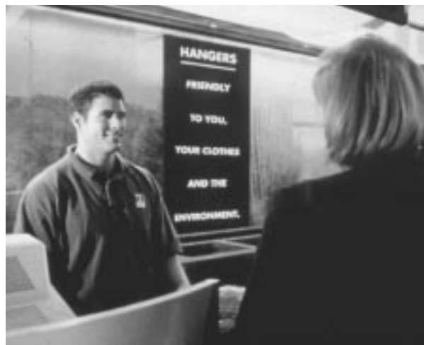
Service Counter at a Hangers™ Cleaners Store

Micell works closely with the North Carolina State University (NCSU) College of Engineering and the College of Textiles. The company's research in the area of liquid CO 2 cleaning technology has resulted in the issuance of new patents to Micell. In addition, Micell has licensed patented cleaning agent components from the University of North Carolina at Chapel Hill and from Pacific Northwest National Laboratories. These cleaning agent developments have been extended by Micell's team of scientists and engineers, resulting in the high performance and cost effective liquid CO 2 cleaning solution used in the Micare™ system's MICO 2 ™ machine.