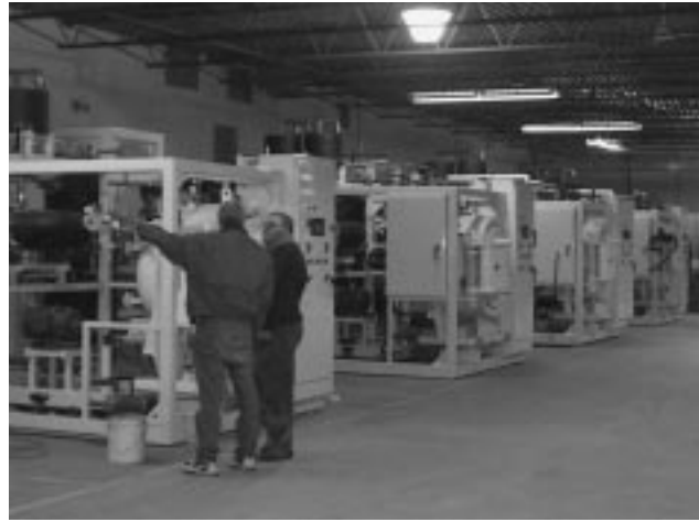
The Micell Technologies Production Facility in Midland, Michigan

Micell works closely with the North Carolina State University (NCSU) College of Engineering and the College of Textiles. The company's research in the area of liquid CO 2 cleaning technology has resulted in the issuance of new patents to Micell. In addition, Micell has licensed patented cleaning agent components from the University of North Carolina at Chapel Hill and from Pacific Northwest National Laboratories. These cleaning agent developments have been extended by Micell's team of scientists and engineers, resulting in the high performance and cost effective liquid CO 2 cleaning solution used in the Micare™ system's MICO 2 ™ machine.