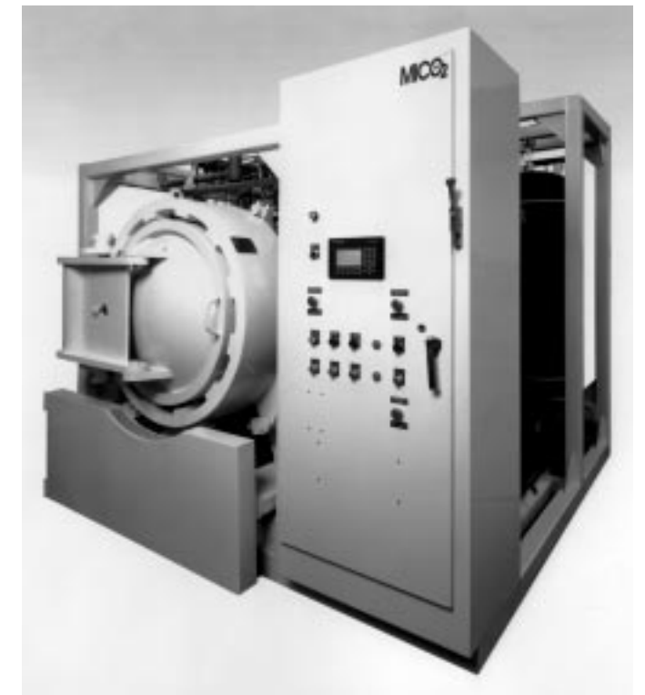
The Micare™ System MICO 2 ™ Machine

Micell Technologies asserts that the Micare™ system offers excellent cleaning performance across most garment components and a wide range of stains and soils. Also, since liquid CO 2 technology operates at room temperature, any stains that may remain on a garment after the wash cycle are not heat-set as can occur with traditional drycleaning systems. Because stains are not heat-set, post-spotting is very effective. In addition, the company has developed effective pre-treatments to further facilitate cleaning performance.