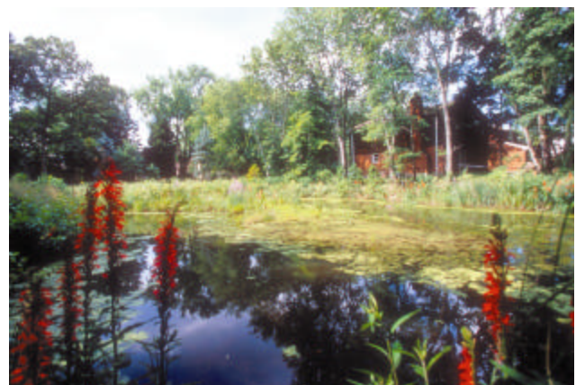
Figure 3b: 18-inch deep pond in Staten Island, New York (illustrating open water where Pickerelweed should be growing)