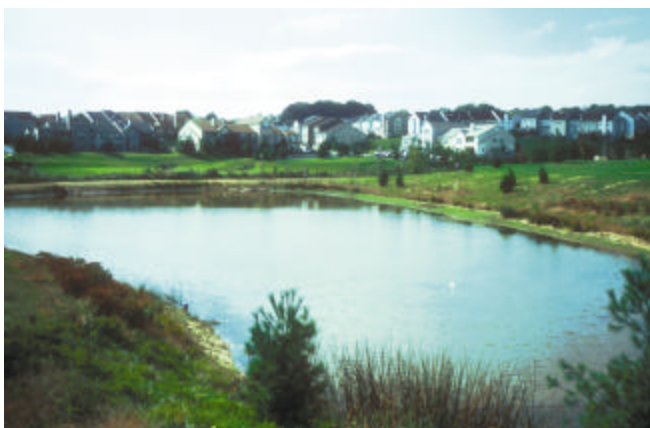
Figure 3a: 2-foot deep pond in Montgomery County Maryland (illustrating open water where a shallow marsh should be present)