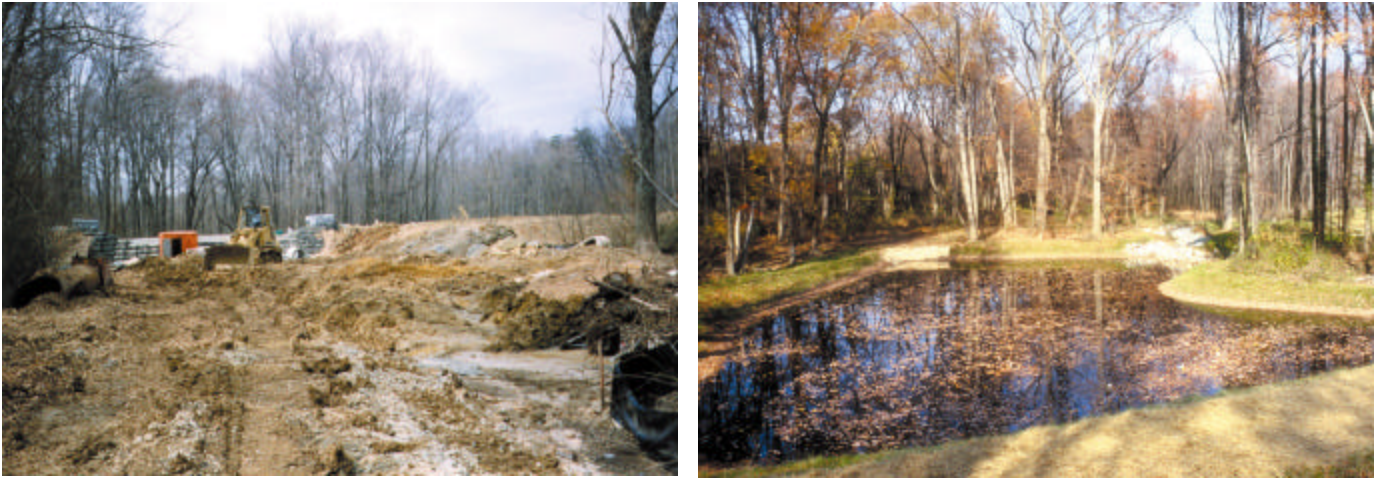
Figure 4: University Boulevard Retrofit project in Maryland – during and after construction (illustrating the complexity of winter construction on the left and the successfully completed project on the right)