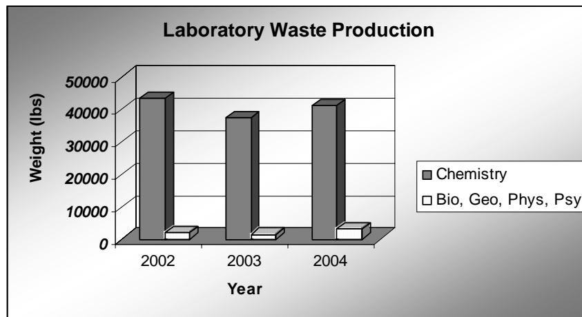
Figure 1. Change in waste totals over time.

There was also significant growth in the non-chemistry labs. The near doubling seen from 2003-2004 can be explained by addition of new faculty in Biology, Psychology and Physics, an increase in the number of graduate students, and an increase in the activity of the Physics Department. The Physics Department is gaining prominence in the field of nanotechnology, and while the results of their work are very small (and nanotechnology may eventually be a significant pollution prevention tool), the activity required to achieve those results has increased the amount of hazardous waste they produce.