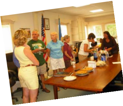
After the day's event, light refreshments and conversation were enjoyed by all those in attendance.