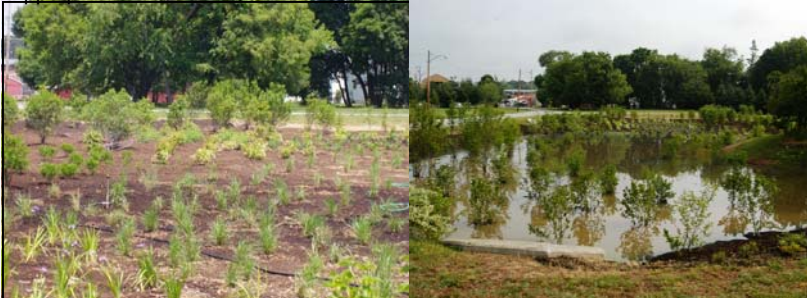
Appoquinimink Watershed Association

Before and after rain: A rain garden stormwater retrofit from a dry pond to a rain garden.