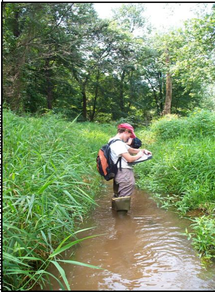
Appoquinimink Watershed Association

One of the main purposes of the Association is to educate all groups living, working and playing in the watershed and surrounding areas as to how they affect the Appoquinimink River and what they can do to help protect it. The As-