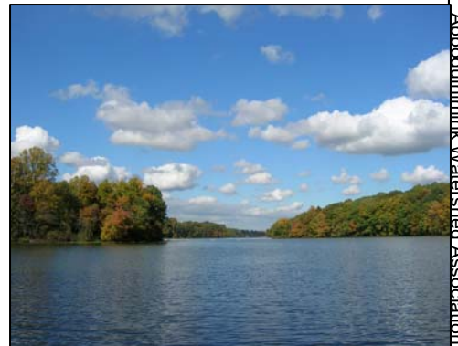
Appoquinimink Watershed Association