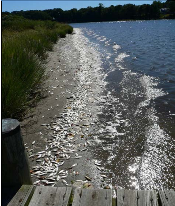
Fish Kill in the Corsica