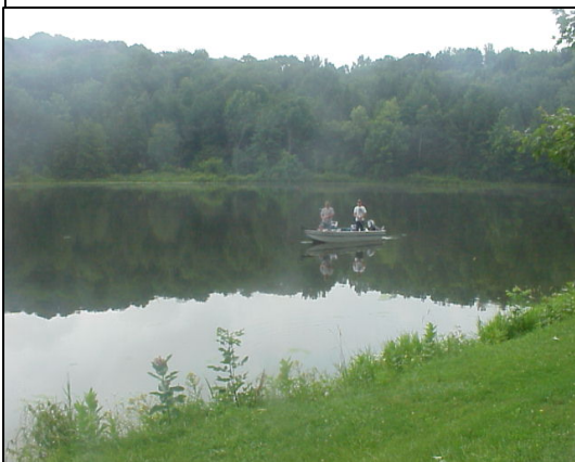
Stephen Foster Lake, Bradford County, PA