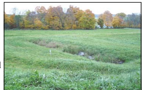
Constructed Wetland for treatment of milk house waste and manure runoff.

The goal of bottom water withdrawal is to minimize the lake's internal phosphorus loading. This process has been approved by PADEP contingent on acceptable dissolved oxygen and iron levels in the stream below the discharge. If successful, this technique could become an annual BMP to improve the water quality in Stephen Foster Lake.