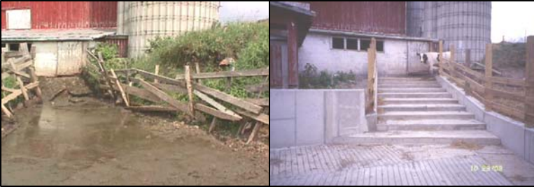
Farm feedlot before and after infrastructure improvements.

Although an intensive amount of work was done above the lake, water quality data will be slow to follow due to the large amounts of sediment and phosphorus that currently reside in the lake. These large amounts of residual phosphorus can become available in the lake as a result of seasonal mixing, resulting in the lake being susceptible to algal blooms.