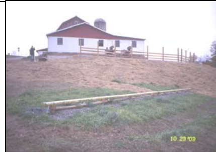
Barnyard runoff and milk house waste infiltration.

enhance water quality in Stephen Foster Lake. Preliminary water quality data collected in the lake since 2004 reflects slight decreases in the levels of total phosphorus and total suspended solids. of seasonal mixing, resulting in the lake being susceptible to algal blooms.