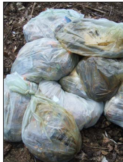
Figure 1--Illustration of "food residuals": Pre- and Post-consumer food wastes, cardboard, and manufactured compostables.