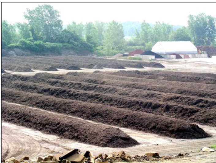
Figure 16--Windrows at Barnes Nursery, Inc., above. Hazel removes contaminants from windrows daily, right.

Special Note: Barnes Nursery also indicated that in their county they must pay a $5/ton fee on food residuals diverted from the county landfill, as the county needed to recoup revenues lost resultant of diversion. While the county wants to be supportive of waste reduction efforts, it loses money by doing so. Sharon Barnes noted that in diversion programs it's essential to find a win-win situation for all involved--for the generators, the haulers, the landfill and the composter. Otherwise, diversion programs won't be sustainable over the long run.