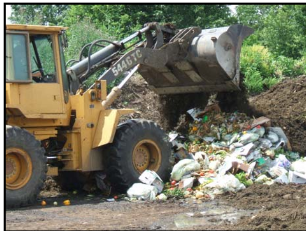
Figure 13--Newly arrived food residuals are immediately covered with ground yard waste at Barnes Nursery, Inc. (see, Section 4--Case Studies).

All the While Protecting Health. Because food residuals contain human pathogens, fungi and bacteria, safeguarding people in contact with these materials is important. When processing food residuals, workers should wear protective gloves (and eye wear to protect from splatter, if workers are directly in contact with materials), and keep hands away from face--especially the mouth and eyes. Hands should be cleaned with antibacterial wipes or soap after contact with residuals. Shoes should be checked for contamination and cleaned as needed. Equipment, too, should be washed after handling food residuals, as bacteria and pathogens can spread into finished piles if touched with contaminated equipment. Don't forget the thermometer used to read temperatures in food residual piles: Wash it after every use, and wash the hands holding it, too. Living contaminants can easily be managed by taking precautions and enforcing sanitation.