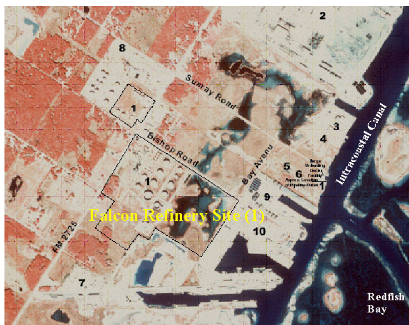
Falcon Refinery aka National Oil Recovery Corporation Ingleside, San Patricio County, Texas TXD 086 278 058