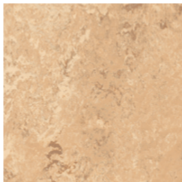
Vibrant colors with texture