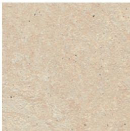
Lightly marbled texture