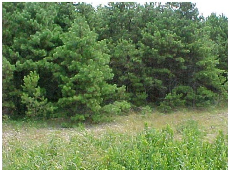
Facing north toward Area E

Also, a decommissioned water supply well located in the immediate vicinity of the BA-4 Disposal Area was sampled for an extensive list of analytes, including metals, between 1999 and 2002. Only lead, at concentrations up to 53 ppb (July 1999), was detected above the MassDEP drinking water action level of 15 ppb.