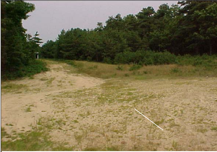
Facing North toward Area A

Rapid Response Actions: Based on soil investigations and geophysical surveys, rapid response actions were conducted at the BA-4 Disposal Area in 2006 and 2007. These included the removal of contaminated soils from Areas A and E, along with intrusive investigations to identify anomalies detected during geophysical surveys of three areas: 1) north of Area E; 2) east of Area A, and 3) west of Area B and south of Area C (areas outlined in blue and purple on map on page 3).