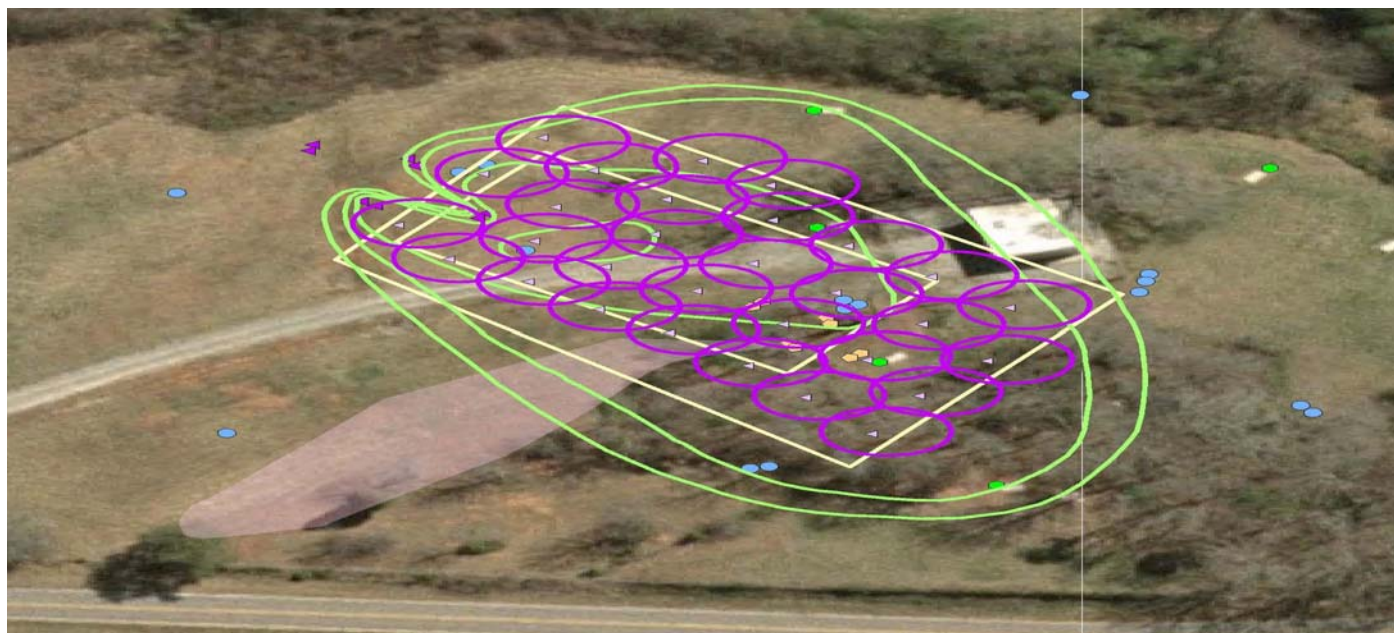
Figure 2 Breazeale Site Injection Site Locations