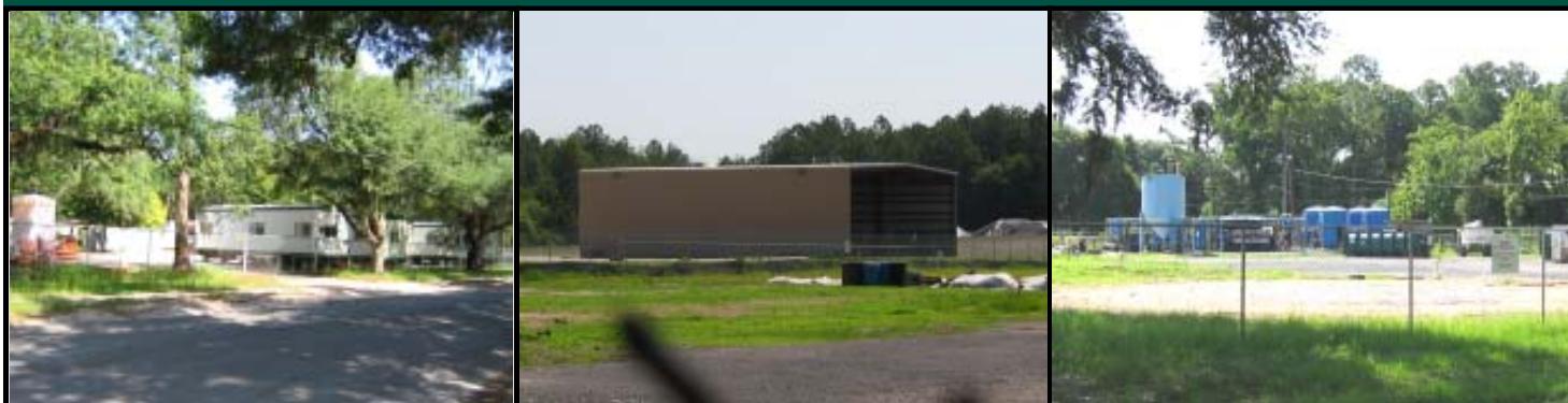
Open space and remediation facilities at the Coleman-Evans Wood Preserving Superfund site

101 Celery Street, Whitehouse, Florida 32220-1806