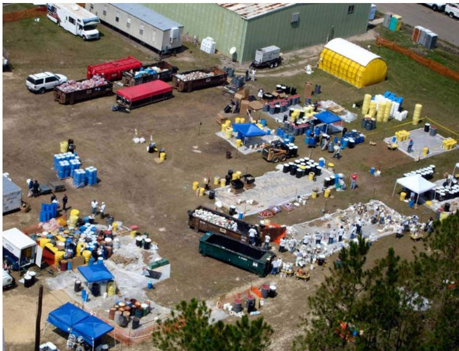
Site Collection Area, Louisiana, 2006