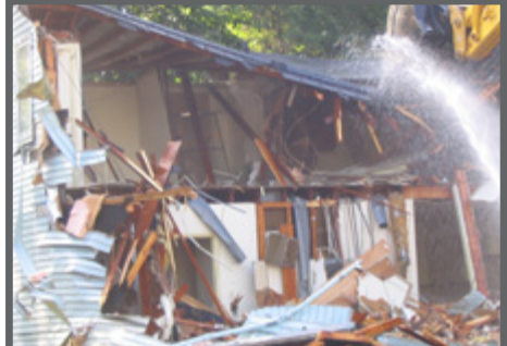
As an outcome of the field testing, the CCLRC staff was able to illustrate the need for additional field oversight. Two additional staff members joined the CCLRC team to focus on contractor performance in the field.

In addition to the aforementioned lessons learned, U.S. EPA Office of Research and Development (ORD) was on-site during the field trial to conduct soils research as part of the Urban Soils Assessment project. Data was collected from the basement excavations following removal of all impervious surfaces. Testing included water infiltration, ground-penetrating radar, soils classification, and compaction testing of existing soils. ORD will return to the sites in 2013 to reassess soil characteristic and to determine the effectiveness of the field trial.