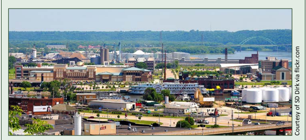
Exhibit 10. Dubuque riverfront. The Mississippi River has been one of the city's most valuable assets throughout its history. Originally used primarily to support industry, it now also helps attract more than 1 million tourists annually.

accomplished by only 18 other cities out of 363 that were examined. <sup>89</sup> In November 2013, its unemployment rate was just 3.5 percent, half the national average, and it had the 17<sup>th</sup> highest gross domestic product growth rate in the country at 5.1 percent. <sup>90</sup>