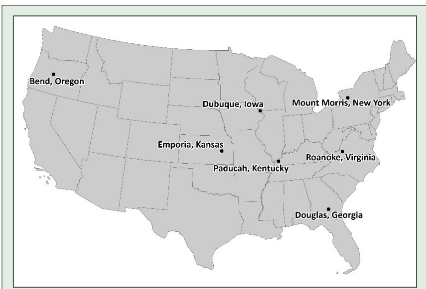
Exhibit 1. Locations of communities profiled. Communities across the country are using local assets to rebuild their economies.

Traditionally, many communities focus their economic development efforts on recruiting major employers such as manufacturers or large retailers. Many communities focus on attracting clusters of related firms and institutions that can benefit from being close to each other. While these recruitment strategies can bring new jobs to a community, recruitment often simply moves jobs from one region to another, rather than creating new jobs. Relying on recruitment alone can be particularly