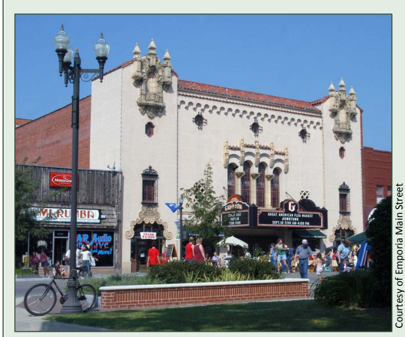
Exhibit 11. Downtown Emporia. Downtown events like the annual Artist Walk, Welcome Week activities for university students, and holiday carriage rides help make downtown a center of life for community residents.

The city and Emporia Main Street also worked together to create and adopt downtown design guidelines to promote mixed-use development and reinvestment in downtown Emporia that contributes to the area's existing historic fabric and character. 106 The design guidelines address the street grid, architectural detailing, construction materials, design principles for adaptive reuse and infill construction, signage, integrating multiple transportation modes into the existing streets, parking design