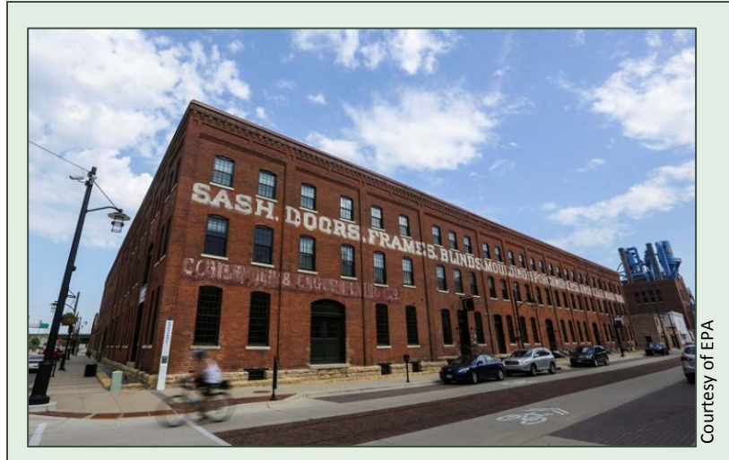
Exhibit 4. Historic Millwork District in Dubuque. Community members identified restoration of the historic Millwork District as one of 10 high-impact projects. Renovated warehouse buildings anchor the neighborhood and preserve a vital part of the city's history and culture.

In 2005, Dubuque, Iowa, invested in a stakeholder-driven planning process to identify 10 high-impact projects for the city. Tens of thousands of people submitted ideas, and community members selected the projects. The community-driven process gave the ideas credibility among donors and residents. All of the projects have been completed or are underway. Roanoke, Virginia, launched an extensive public participation process in 2000 to develop a vision for the future. Ultimately, Vision 2001-2020, the city's comprehensive plan, was passed in 2001, incorporating input from a citizens' advisory