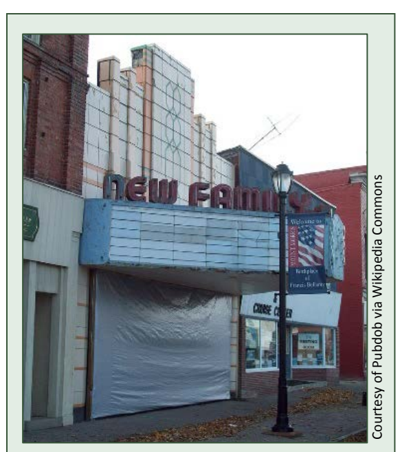
Exhibit 5. New Family Theater in Mount Morris. In 2010, Mount Morris received a $433,500 grant from Restore NY to preserve and renovate the art deco façade and marquee of the 1930s New Family Theater and repurpose the building.

While philanthropic, federal, and state funding is important to communities of all sizes, it is particularly helpful to smaller communities that have limited resources to deal with challenges such as out-of-date infrastructure, vacant and possibly contaminated properties, and relatively few amenities to attract new residents and businesses. Even a small amount of outside money applied strategically to support a community's vision and plans can help increase local interest and commitment in the area and spur private investment. For example, Douglas, Georgia, jumpstarted its downtown revitalization through a streetscape project funded in part by a federal Transportation Enhancements grant. Mount Morris, New York, used a grant from the state's Main Street Program to help restore downtown buildings, which spurred additional private investment. Roanoke, Virginia, used a state program to designate an area as an Enterprise Zone, making new or expanding businesses in that area eligible for incentives including façade grants, tax exemptions, and fee waivers.