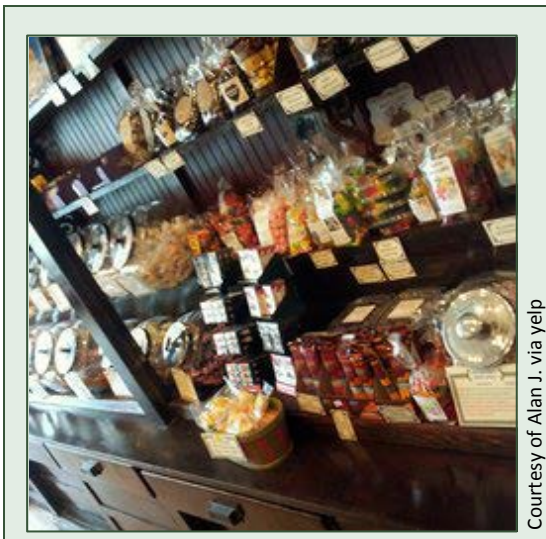
Exhibit 13. Jane's Pantry in Mount Morris. This fine foods and spices shop was one of the first stores to open on the revitalized Main Street. A few years later, its success led the owner to expand by adding a tea room.