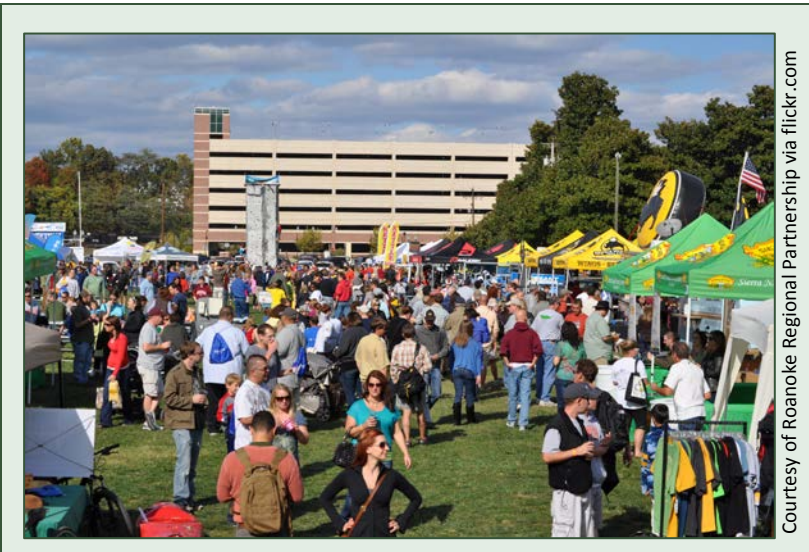
Exhibit 6. Roanoke Go Outside Festival. An annual event to encourage healthy, outdoor recreation brings community members together for music, competitions, demonstrations, and outdoor gear sales.

The tactics all of these small towns are using support not just economic development, but also smart growth, an approach to community development that protects the