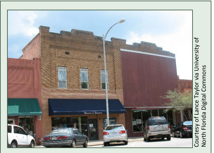
Exhibit 8. Downtown Douglas. The city of Douglas supports small businesses and entrepreneurs and invested to make the downtown an attractive place to locate a business and to shop.

Douglas has also invested in preserving its architectural heritage and making downtown an attractive place for businesses to locate. In the late 1980s, downtown Douglas had a high vacancy rate, and people from the community rarely visited. A Main Street Program was started in 1987 to revitalize the area. One of the program's first activities was a facade grant program to restore Douglas' storefronts. Initially, $10,000 from the city and the Industrial Development Authority (now the Economic Development Authority) provided matching grants for 20 façade improvements, and 20 more façades were improved a decade later.<sup>57</sup> Around the time the Main Street Program was formed, the city applied for and received