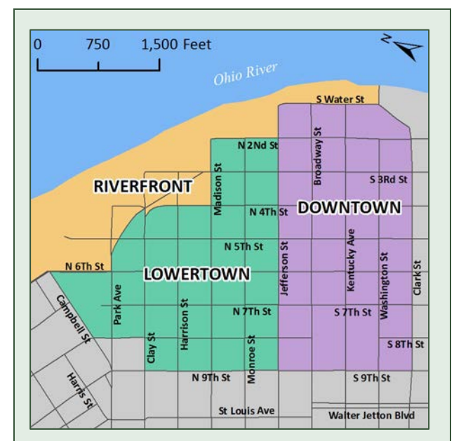
Exhibit 14. Paducah Renaissance Area. The Paducah Renaissance Alliance focuses its efforts on the Riverfront, LowerTown, and Downtown. Map based on information from Renaissance Area Master Plan.

Paducah has used this approach to develop a cohesive identity around its core assets: art, the Ohio River, and history. A key component of nurturing the arts was supporting cultural institutions that would draw activity to the Renaissance Area. The city already was home to the William Clark Market House Museum and Market House Theater, both housed in a