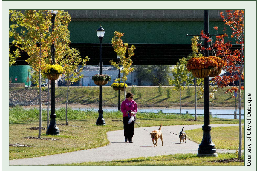
Exhibit 9. Bee Branch Creek restoration. Dubuque reduced the flood risk to over 1,100 flood-prone properties by uncovering and redirecting portions of the creek so that it now flows above ground, saving the city millions of dollars to build new storm sewers and providing residents of nearby neighborhoods an attractive community park.

The $188 million in funding for the project came from a combination of city, state, and federal sources; the Dubuque County Historical Society; and private investment. 76 The first phase of the project included a Mississippi Riverwalk, the National Mississippi River Museum & Aquarium, the Grand River Center, the Grand Harbor Resort, and the historic Star Brewery complex, all of which attracted tourists and additional investment to the area. In 2010, with phase II underway to create a second museum complex, new casino, and new movie