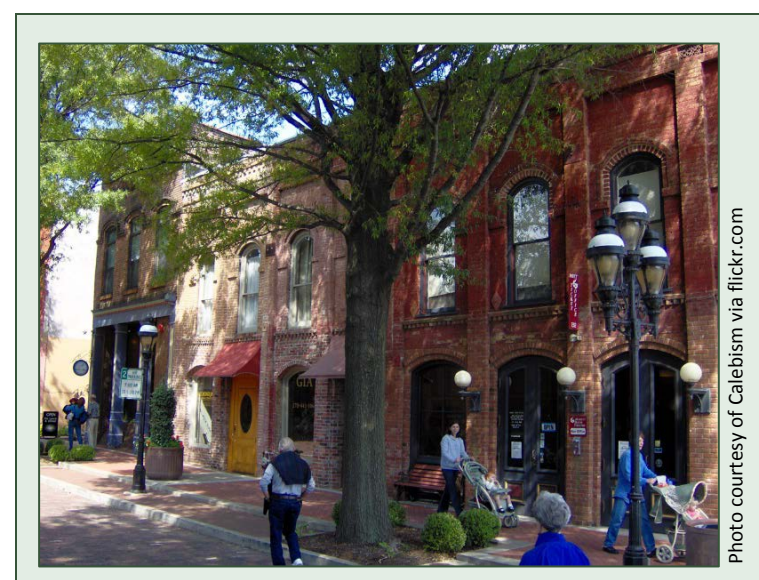
Exhibit 16. Downtown Paducah. The historic buildings and cultural institutions in downtown attract residents and visitors to local shops and businesses.

Paducah's investments in its downtown have strengthened the city's economy. A study conducted by Americans for the Arts found that, in 2007, the nonprofit arts and culture organizations generated $39.9 million in local economic activity in the Greater Paducah region, supporting 819 full-time jobs and generating $3.6 million in local and state government revenue. More than two-thirds of this economic activity was generated by event-related spending, much of it from tourists. Nearly 400,000 people attended arts events in Paducah during 2007, 37.5 percent of whom came from out of state. These out-of-state visitors spent more than five times as much as