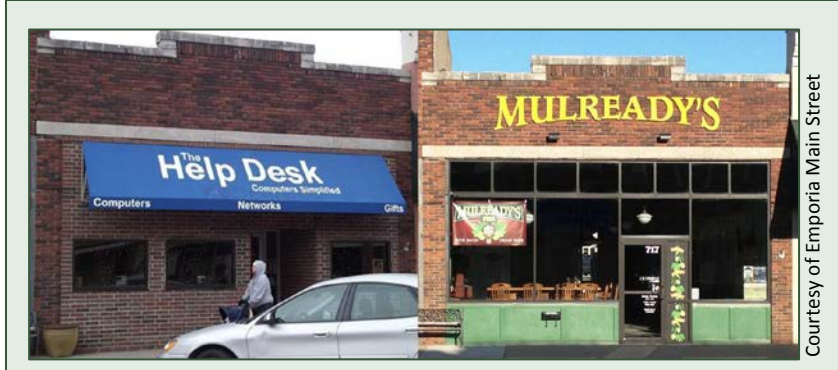
Exhibit 3. Before (left) and after (right) renovation in Downtown Emporia. With the city's encouragement, local businesses are adopting design standards that help make the area appealing to shoppers.

Historic downtowns are also important assets that communities can use to help spur their economies. Downtowns help define a community's identity through distinctive, often historic architecture; shops and restaurants; and community gathering places. Maintaining the places and institutions that make a community special contributes to a sense of place and neighborhood