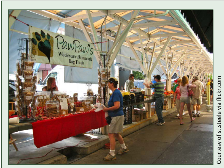
Exhibit 18. Historic Roanoke City Market. Located in the heart of downtown, the City Market is open every day. It has been in operation since 1882 and is a popular destination for both residents and visitors.

This redevelopment project is part of the city's strategy to reuse brownfield properties to provide locations for growth in a city that is 95 percent built out, better use property zoned for industrial and commercial uses, create new jobs and housing, increase the tax base, and correct environmental problems. In 2008, the Roanoke City Council adopted the City-Wide Brownfield Redevelopment Plan, which establishes the city's role in brownfields redevelopment and encourages and facilitates reinvestment in brownfield properties. 186