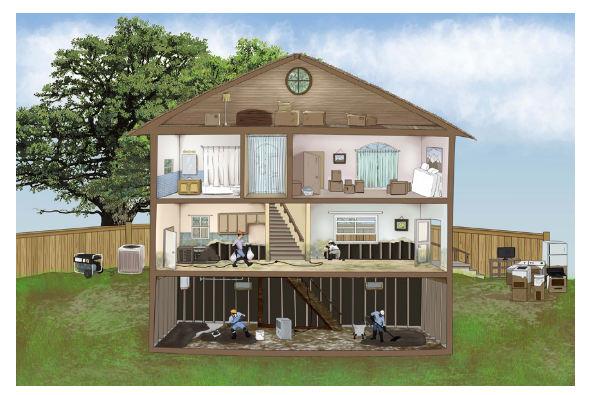
During flood cleanup, completely drying your home and removing water-damaged items are critical tasks.

You should remove all standing water as soon as possible. Use a wet vacuum to remove water from floors, carpets and hard surfaces.