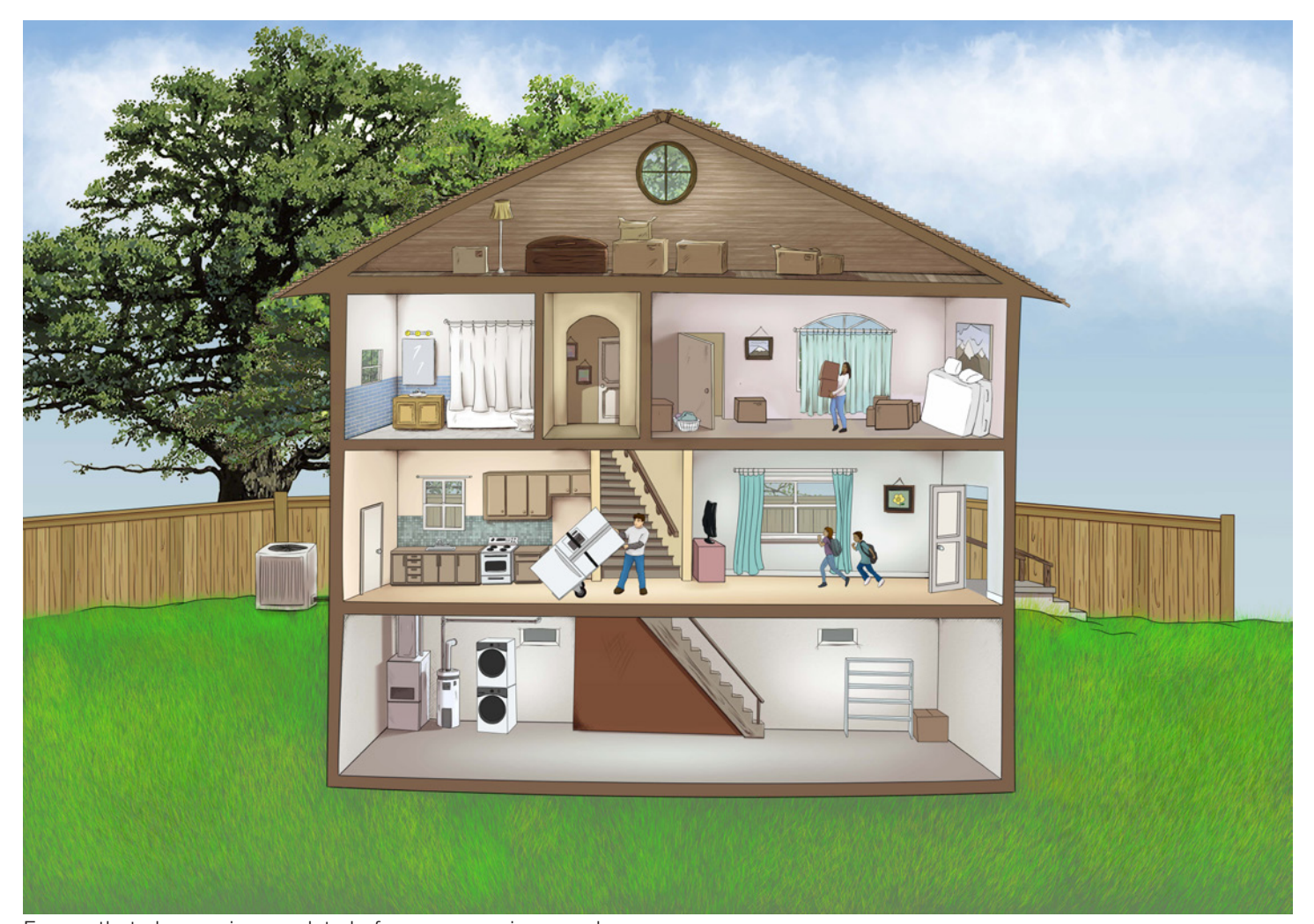
Ensure that cleanup is complete before reoccupying your home.

and air conditioning system. You should consider what materials your ducts are made from and whether all directions on the product are appropriate for use in ducts before using chemicals in your ventilation system. If you can, hire a professional to do this for you. EPA's Should You Have the Air Ducts in Your Home Cleaned? provides information on the use of chemical biocides in ducts and tips for choosing a duct cleaning service provider. The section "Should chemical biocides be applied to the inside of air ducts?" describes some issues you should talk about with your service provider before they use a biocide in your ductwork.