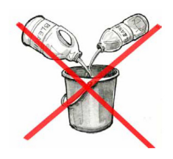
DO NOT mix bleach and ammonia because the combination can create toxic vapors.

You can usually clean and dry materials that do not soak up water, such as metal, glass and hard plastic. You should throw away materials that soak up a lot of water, such as drywall, carpets and ceiling tiles. Mold: Worker and Employer Guide to Hazards and Recommended Controls provides more information about whether to clean and dry or to throw away different types of wet materials. The Homeowner's and Renter's Guide to Mold Cleanup After Disasters explains how to separate debris for removal.