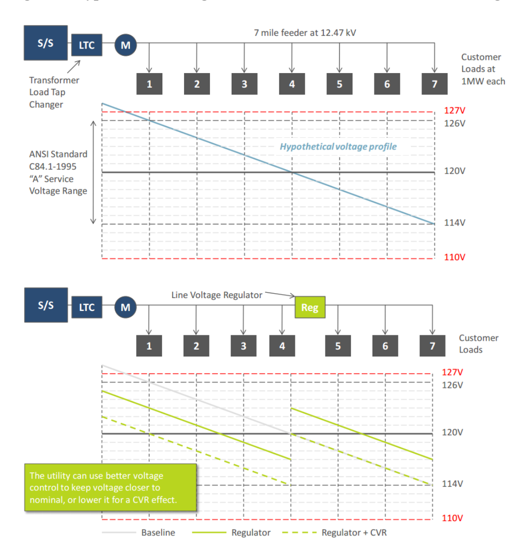
Figure 4. Hypothetical Voltage Profiles with and without VVO Technologies