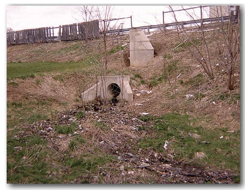
Storm water in a city is usually collected in storm sewers and transported to a stream in large pipes. This photo shows water exiting a pipe into a stream.

ground and empties into stream channels days and even months after soaking into the soil. This groundwater provides flowing water in the channel even during dry times. When impervious surfaces prevent infiltration of rainwater, there is less groundwater to move into the channel.