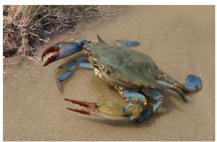
Many animals, including the blue crab, rely on coastal wetlands for food and shelter. Protection of wetlands is important to crab and other commerical fisheries along the coast.