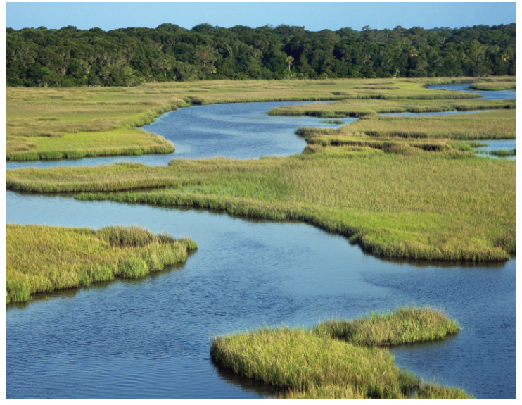
Tidal marshes and other coastal wetlands buffer coastal areas against storm and wave damage and help stabilize shorelines. These functions have become more important due to climate change.