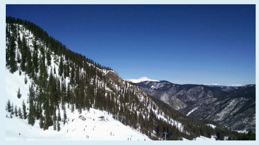
Ski areas like Taos Ski Valley (shown here) depend on seasonal snowpack, which has declined at all long-term monitoring sites in the Sangre de Cristo range.