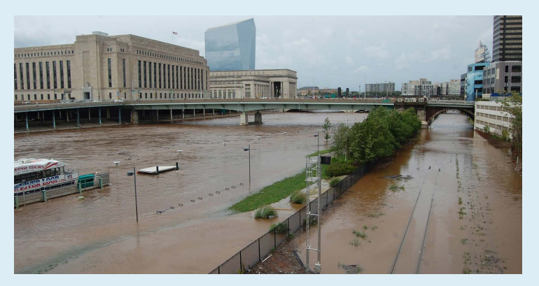
In 2011, Hurricane Irene caused the Schuylkill River to overflow its banks, flooding a rail line, bike path, and other infrastructure in Philadelphia.

Rising temperatures and shifting rainfall patterns are likely to increase the intensity of both floods and droughts. Average annual precipitation in Pennsylvania has increased 5 to 10 percent in the last century, and precipitation from extremely heavy storms has increased 70 percent in the Northeast since 1958. During the next century, annual precipitation and the frequency of heavy downpours are likely to keep rising. Precipitation is likely to increase during winter and spring, but not change significantly during summer and fall. Rising temperatures will melt snow earlier in spring and increase evaporation, and thereby dry the soil during summer and fall. As a result, changing the climate is likely to intensify flooding during winter and spring, and drought during summer and fall.