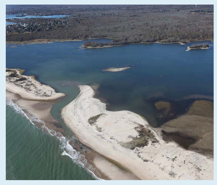
Hurricane Sandy caused a storm surge that breached the barrier beach at Trustom Pond in Charlestown in 2012. Sea level rise leads to higher, more damaging storm surge.

Coastal cities and towns will become more vulnerable to storms in the coming century as sea level rises, shorelines erode, and storm surges become higher. Storms can destroy coastal homes, wash out highways and rail lines, and damage essential communication, energy, and wastewater management infrastructure.