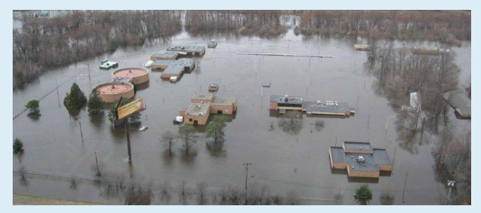
Historically heavy rains in spring 2010 caused the Pawtuxet River to flood the Warwick wastewater treatment plant (shown here) and many homes and businesses.

Rising temperatures and shifting rainfall patterns are likely to increase the intensity of both floods and droughts. Average annual precipitation in the Northeast increased 10 percent from 1895 to 2011, and precipitation from extremely heavy storms has increased 70 percent since 1958. During the next century, average annual precipitation and the frequency of heavy downpours are likely to keep rising. Average precipitation is likely to increase during winter and spring, but not change significantly during summer and fall. Rising temperatures will melt snow earlier in spring and increase evaporation, and thereby dry the soil during summer and fall. So flooding is likely to be worse during winter and spring, and droughts worse during summer and fall.