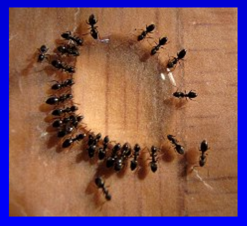
Liquid bait.