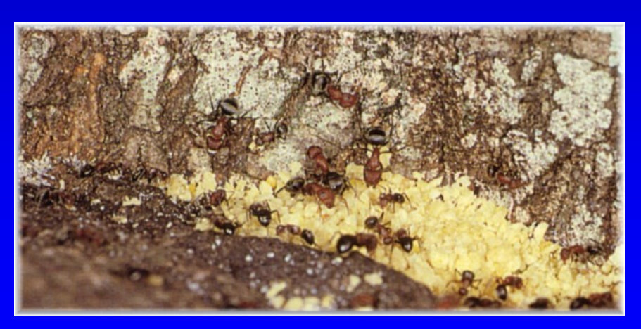
Carpenter ants feeding on granular bait.