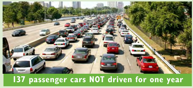
Source: EPA's Greenhouse Gas Equivalency Calculator. Available at http://www.epa.gov/cleanenergy/ energy-resources/calculator.html.

Yakama Nation disposed of 192 appliances in the pilot program; this resulted in 717 MTCO<sub>2</sub>e GHG emissions reductions, equivalent to approximately: