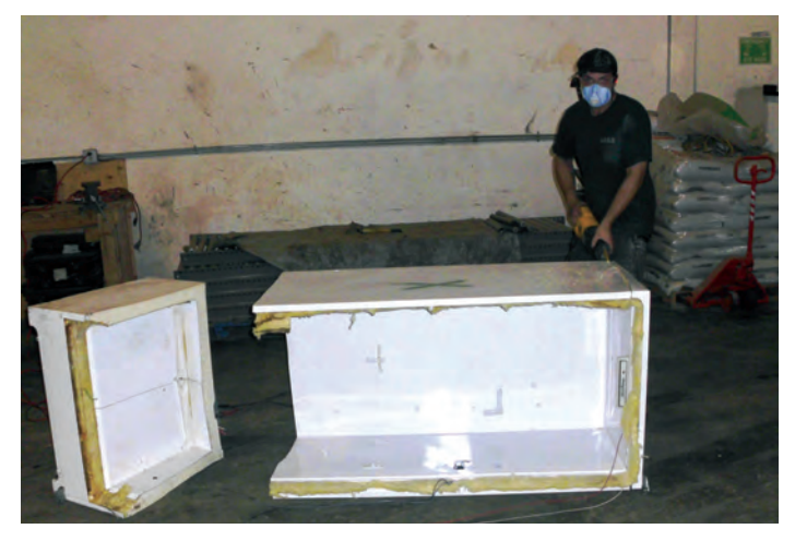
Figure 7: JACO employee removes insulation foam from refrigerator