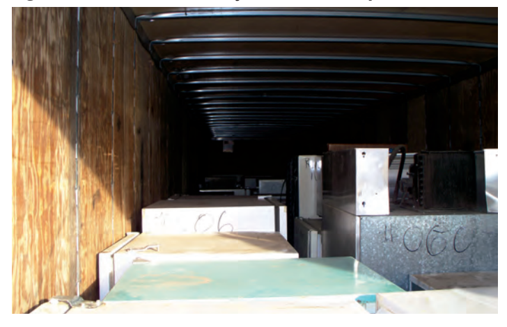
Figure 4 depicts the units stored inside. Yakama Nation staff estimated that for each pick-up, a total of roughly 12 miles were traveled prior to reaching the central transfer station.

Each truck held approximately 65 units. Once the truck was filled, Yakama Nation staff contacted JACO to exchange it for an empty one. This procedure continued until all 192 units were taken to the JACO processing facility located 300 miles away in Everett, Washington. The first shipment on October 20 contained 67 units, followed by a second load of 63 units on October 28, and a final load of 62 units on November 11, 2010. The 3 truckloads sent to the processing facility traveled a total distance of 1,800 miles.