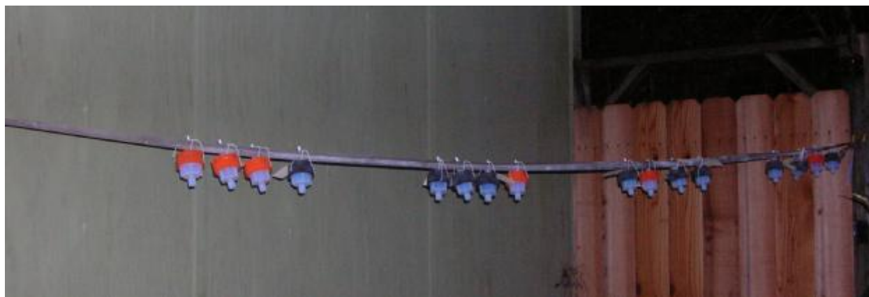
Figure 1. Field Cr6+ Sample Stability Study

The filters were left for 33 hours – 24 hours (based on 1 day) plus 9 hours (needed for sample retrieval). All samples were analyzed on the day the samples were recovered, as presented in Table 3.