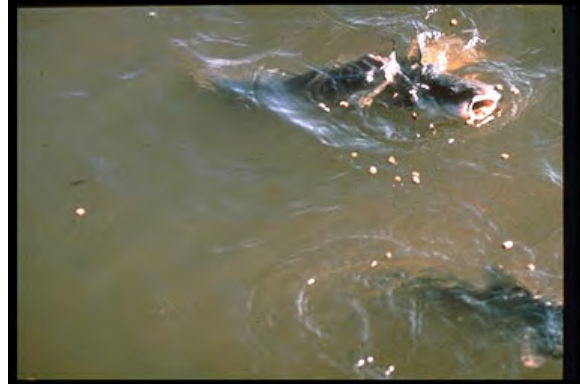
Channel Catfish feeding at the surface of the water.

Fish do not convert all of the applied feed to flesh. The difference between the input of a substance in feed and the amount of a substance in the harvested fish represents the amount of the substance that enters the pond ecosystem as uneaten feed and in fish feces and metabolites. Uneaten feed and feces are decomposed to metabolites, like carbon dioxide, ammonia, and phosphate, by pond bacteria. These substances are nutrients for the production of phytoplankton, and they also represent potential pollutants in pond effluent. Nutrient inputs and phytoplankton abundance increase as feeding rates increase. Mechanical aeration is used to maintain adequate levels of dissolved oxygen and encourage the oxidation of ammonia to nitrate by nitrifying bacteria. Deterioration of water quality from increased nutrient inputs stresses fish, and causes them to eat less, grow slowly,