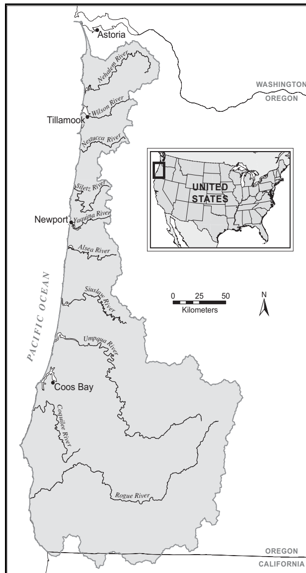
Figure 1. Oregon coastal watersheds considered in this study.