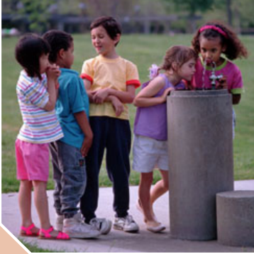
Safe drinking water is a critical resource