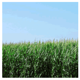
Corn: the primary source of fuel-grade ethanol

About ten years ago, EPA saw an increase in drinking water contaminated with methyl tertiary-butyl ether (MTBE), a chemical added to gasoline to make it burn cleaner and improve air quality. Since underground storage tanks at facilities such as gas stations had historically stored gasoline, diesel, or other petroleum products, this increase in MTBE contamination led to heightened awareness of the potential risks posed by fuel additives. And EPA is facing this challenge again, but with biofuels instead of MTBE.