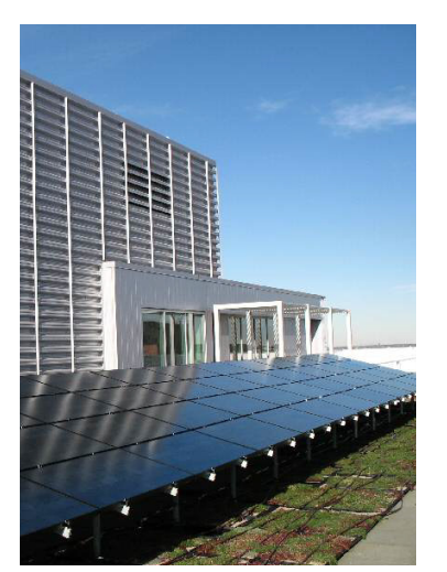
Solar panels on a green roof

a cleanup on the soil, water, and air; and minimizing or eliminating pollution at the source. It's a new way of thinking for some, but worth the effort. A green cleanup may save energy, fuel, and dollars over traditional methods. And with almost 103,000 underground petroleum tank releases in the cleanup backlog, we have a great opportunity to reduce the footprint of cleanup and promote sustainability.