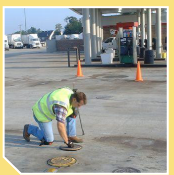
Inspecting a spill bucket

Designating tribal inspectors as authorized representatives of EPA to inspect underground tanks can help increase the geographic coverage and frequency of inspections in Indian country. It also helps enhance relationships and increase the capabilities of tribal inspectors. In 2007, EPA regions first began issuing federal credentials, and so far inspectors from the Eastern Band of the Cherokee Indians, Navajo Nation, Nez Perce Tribe,