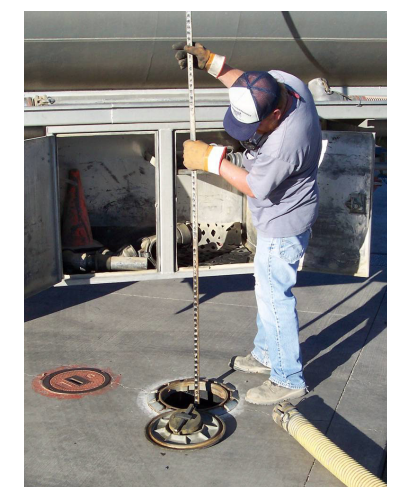
Measuring the product level in a tank

Although we are only in the first three-year inspection cycle, our collective efforts are starting to pay off. After a slight decline, compliance rates are beginning to improve and fewer new leaks are being reported each year. And by continuing our investment in inspections, EPA hopes to see even fewer new releases and a bigger payoff. Preventing just one new release will save $125,000, the estimated average cost to clean up a contaminated site. So it's easy to see that an upfront investment in inspections - our program's ounce of prevention - is certainly worth a pound of cure