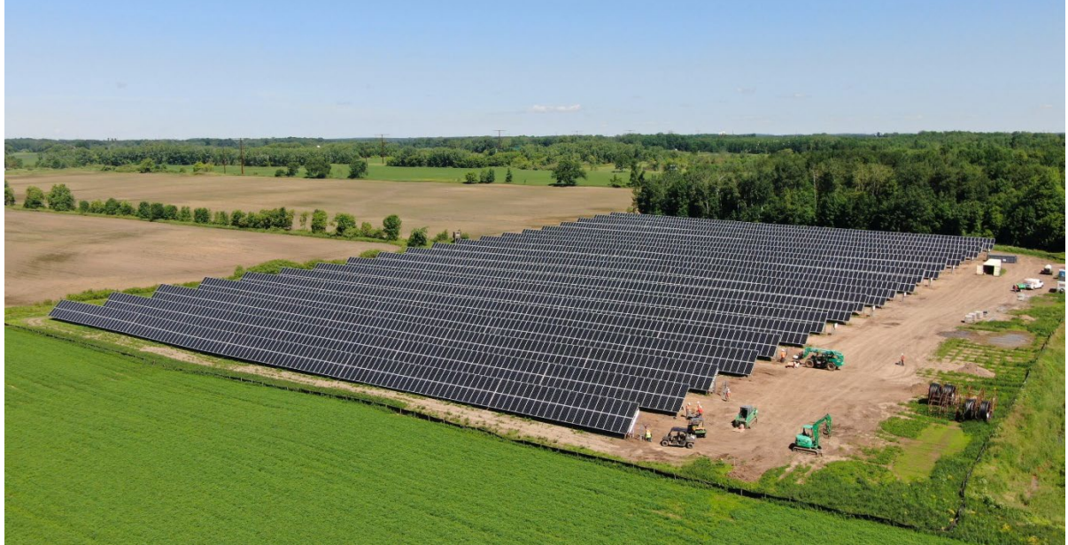
The new 1.852 MW solar field at Green Valley Dairy was installed by Arch Electric and began operation in September 2020.

The solar energy generated by the project powers portions of the dairy, including a newly installed biogas upgrading plant, developed in partnership with Outagamie Clean Energy Partners, which will be used to upgrade the gas into pipeline-quality renewable natural gas for the transportation industry. Annually, the solar array will offset greenhouse gas emissions equivalent to more than 390 cars driven in one year.