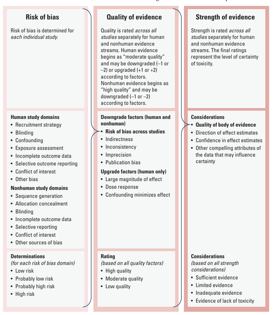
Figure 1. Overview of the Navigation Guide systematic review process to rate the quality and strength of the evidence.

On the basis of the recommendations mentioned above, we also included study funding source and declared financial conflicts of interest as a potential source of bias (i.e., whether the study received support from a company, study author, or other entity having a financial interest in the outcome of the study). We refer to this risk of bias domain generally as "conflicts of interest," although for this particular case study we assessed only competing financial interests within this domain. A complete list of the human and nonhuman risk of bias domains is presented in Figure 1; detailed descriptions of each