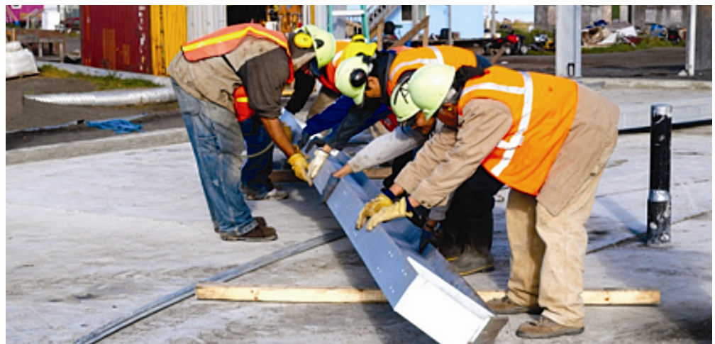
Local construction crew prepares to erect a building to house a new water treatment plant.

The Alaska Native Villages program implements projects that stimulate local economies through public health-related economic gains and local job creation. EPA has invested $460 million in infrastructure projects and generated substantial economic benefits through public health improvements. Safe drinking water and sanitary sewer services increase economic productivity by reducing exposure to raw sewage and drinking water contaminants that cause respiratory illnesses, skin infections and diarrhea and other gastrointestinal diseases. Additional economic benefits are provided by gains in productivity from improved health, reduced health care costs and convenience time savings to individuals, which is the time saved that a patient would otherwise incur in seeking medical attention and treatment.