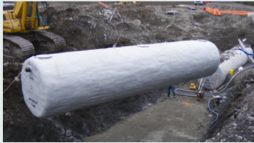
Primary treatment tank installation for the Gulkana wastewater treatment system.

The Alaskan Native Village of Gulkana, located approximately 190 miles northeast of Anchorage, needed critical improvements to its wastewater treatment and disposal facility. The community's existing facility had failed, and untreated wastewater was being discharged directly into the Gulkana River. The river is a critical resource—known for an abundance of king and red salmon—and is critical for the village, whose subsistence lifestyle depends on plentiful harvests. The river also draws sports fishermen from all around the country.