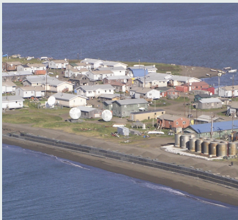
Aerial photo of Kivalina, Alaska.

Kivalina is located approximately 630 miles northwest of Anchorage at the tip of a long barrier island in the Arctic Ocean. Severe arctic winters, coupled with remoteness, limit the community's access to its only source of fresh water, the Wulik River. Located 3 miles away, the community is only able to draw fresh water from the river during the short summer, from June to September. As the winter sets in, the community's central raw water storage tank is completely filled one last time and must meet all water needs for Kivalina residents until the following June. Community water needs such as drinking water, bathing and laundering are completely dependent on the reserves in the raw water storage tank.