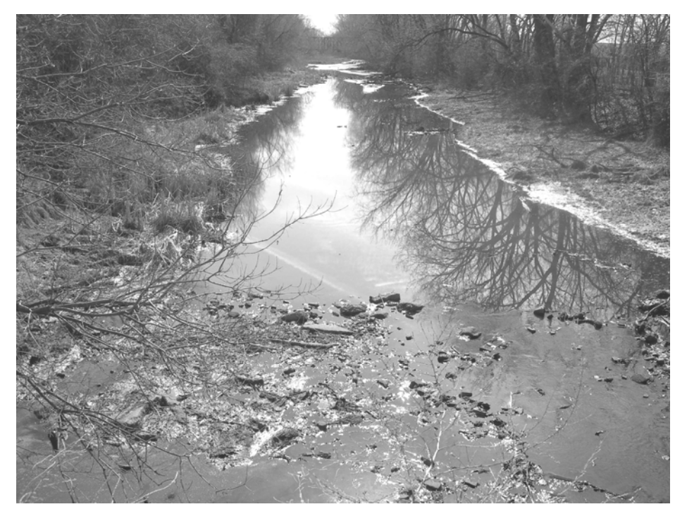
This stretch of the West Branch Grand Calumet River appears picturesque, but the river sediment is highly contaminated. A new Great Lakes Legacy Act project will remove 91,000 cubic yards of polluted sediment followed by capping of the river bottom.

The $33.1 million project is being funded under the Great Lakes Legacy Act (GLLA). The Act provides federal money that along with local matching dollars are used to clean up polluted sediment (mud) along the U.S. shores and waterways of the Great Lakes. EPA's Great Lakes National Program Office, the U.S. Fish and Wildlife Service, Indiana Department of Environmental Management (IDEM) and Indiana Department of Natural Resources (IDNR) are cooperating in the project. The Grand Cal work calls for the removal of about 91,000 cubic yards of polluted sediment followed by the placement of a cap over the dredged area. The sediment contains pollutants such as PCBs and PAHs (polychlorinated biphenyls and polycyclic aromatic hydrocarbons), heavy metals, and pesticides. The removal will be conducted between Columbia