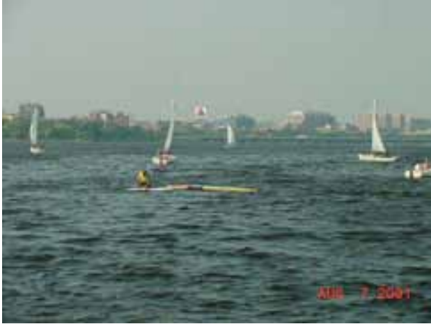
Figure 3: Windsurfing on the Lower Charles River

In 1995 EPA Region I launched the Clean Charles initiative aimed at making the Lower Charles River fishable and swimmable—the goals of the CWA. At that time, the Lower Charles River was meeting swimming standards for bacteria 19% of the time and boating standards for bacteria 39% of the time based on Charles River Watershed Association (CRWA) data. (EPA, 2008) In 2007, the Lower Charles River was meeting the bacteria standard for swimming 63% of