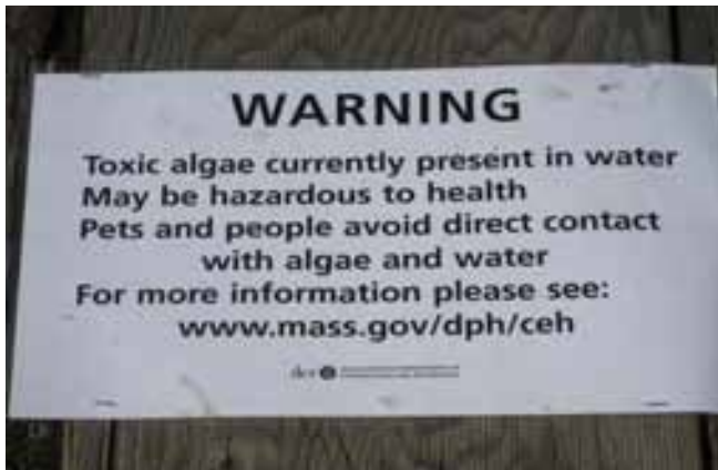
Figure 4: MA DPH posting along the Banks of the Lower Charles River in August 2006

consumes algae and is, in turn, preyed upon by many fish species. Three genera of cyanobacteria -- Anabaena , Aphanizomenon , and Microcystes -- are commonly associated with the spread of cyanobacteria in fresh water lakes (Mattson et al., 2003; USEPA, 2003; DEP et al., 2007). All three genera have been consistently observed in the Lower Charles River during all summers when algal sampling was conducted (DEP et al., 2007). During the summers of 2006 and 2007, very severe blooms occurred in the Lower Charles River, causing the Massachusetts Department of Public Health and the Massachusetts Department of Conservation and Recreation to post warnings for the public and their pets to avoid contact with the river water. This included recreational uses -- such as windsurfing and kayaking -- that have become commonplace as bacterial contamination has been dramatically reduced.