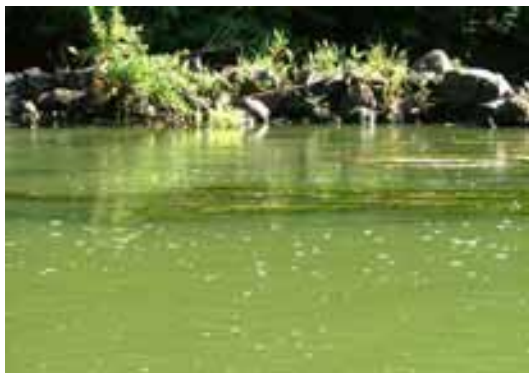
Figure 9: Blue-green Bloom in Populatic Pond (DEP September 2004)