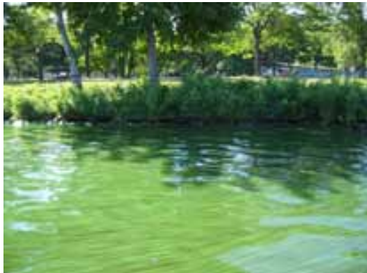
Figure 8: Blue-Green Bloom in the Lower Charles River, August 2006

bloom, DEP collected and analyzed samples from a bloom that began in Populatic Pond and that had cell counts of over 200,000 cells/ml (Beskenis 2005), a level that is ten times greater than the concentration at which aesthetic conditions become impaired, as discussed below.