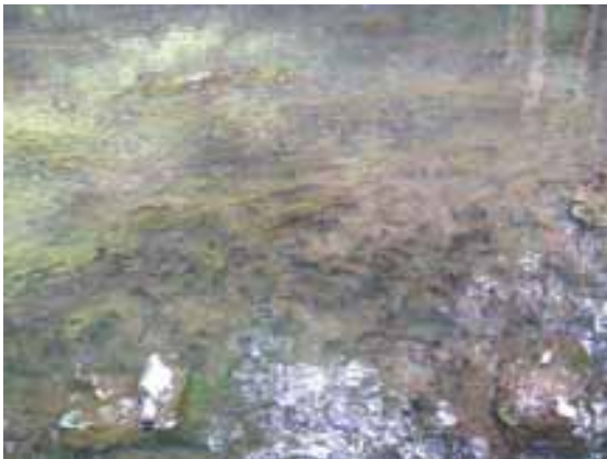
Figure 7: Attached Algae on Charles at Franklin

Overabundant algae and aquatic plants caused by excess phosphorus produce suspended and settleable solids in concentrations and combinations that impair assigned uses, harm benthic biota and degrade the chemical composition of the bottom. Harm to benthic biota occurs through the degradation of habitat and changes in water quality in a number of ways. First, proliferation of attached algae (i.e., periphyton) along the bottom of the river causes a loss of desirable fish habitat and a loss of diversity in the benthic invertebrate community. Figure 7 shows dense growths of attached algae in the mainstem of the Charles River in Franklin. The bottom substrate is almost entirely covered by thick mats of algae that eliminate nooks and crannies among the rocks and cobbles providing important habitat to benthic organisms and small fish. As noted in the discussion on nutrients immediately above, phosphorus and the algal growth to which it contributes degrades the chemical composition of the water by lowering DO levels, as well.