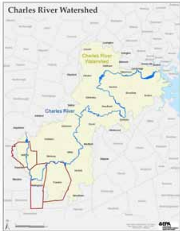
Figure 1: Charles River watershed with Milford, Bellingham and Franklin Outlined

The entire Charles River drains a watershed area of 310 square miles (MAEOEA, 2008). Two hundred and sixty-eight square miles of that watershed area drain over the Watertown Dam into the Lower Charles River (Breault et al., 2002). The remaining 42 square miles drain directly into the Lower Charles River. There is also a combined sewer drainage area near the downstream end of the Lower Charles River.