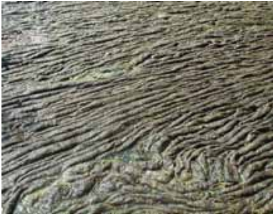
Figure 5: Floating Scum at Charles River in Medway