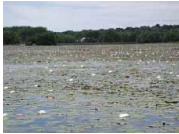
Figure 6: Charles River at Milford Pond

Figure 6 depicts floating solids in the form of plant life that impair primary and secondary uses of the Charles River at one of its impoundments, Milford Pond. Algae and scum also cause aesthetically objectionable conditions, as outlined in the aesthetic standards violations section below.