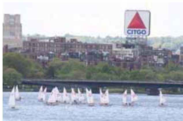
Figure 2: Sailboat Racing on the Lower Charles River (Walsh-Rogalski)

Milford, Franklin and Bellingham, Massachusetts drain, in whole or in part, into the Charles River upstream of the Watertown Dam. As indicated in Figure 1, these communities are located in the upper Charles River watershed. These upper watershed communities are the first places where the Charles River shows significant signs of cultural eutrophication (MAEOEA, 2008; CRWA, 2004 and 2006; Beskinis, 2005). The portion of the Charles River that is downstream of the Watertown Dam is referred to as the Lower Charles River. The Lower Charles River is one of the most historically and culturally significant rivers in the United States. The river and its adjacent parkland are used by the public for recreation, including windsurfing, sailing, rowing, running, and other water and non-water related recreation by an estimated 20,000 people on an average day (Breault et al., 2002).