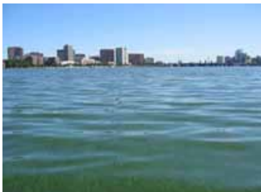
Figure 10: Blue-Green Bloom in the Lower Charles River, August 2006

The discussion immediately above on nutrients, solids, color and turbidity addresses how excess phosphorus contributes to conditions that violate the objective components of the aesthetics criteria, such as the existence of scum and color. The discussion also indicates the presence of undesirable and nuisance species of aquatic life, another example of a violation of the objective component of the aesthetics criterion related to nutrients. In addition to these objective conditions, the aesthetics criterion also contains a subjective component in that it refers to conditions that are “objectionable.”