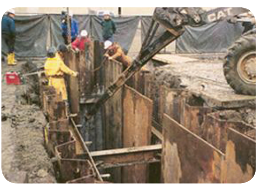
Construction of a PRB in Sunnyvale, CA

PRBs are a relatively inexpensive way to clean up groundwater. No energy is needed because PRBs rely on the natural flow of groundwater. The use of some materials, such as limestone, shell fragments, and mulch, can be very inexpensive, if locally available. No equipment needs to be above ground, so the property may continue its normal use, once the PRB is installed.