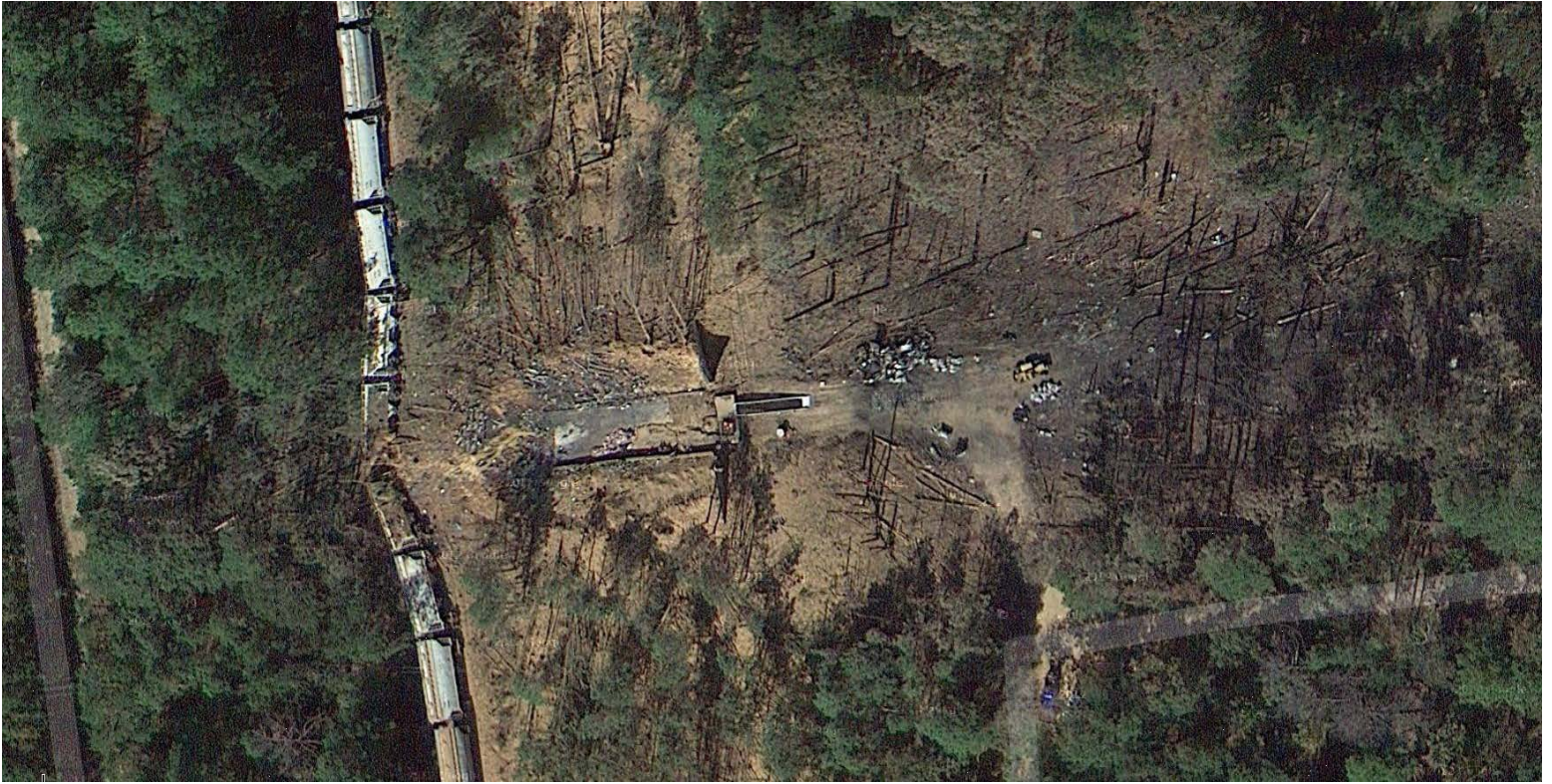
Photo 10: Result of explosion of magazine storing black powder and tractor trailers storing M6 Propellant in October 2012