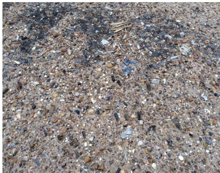
Photo 2: M6 Propellant scattered on the ground (after October 2012 explosion)