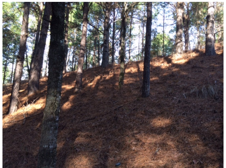
Photo 5: Trees growing on top of explosive storage magazine at Camp Minden