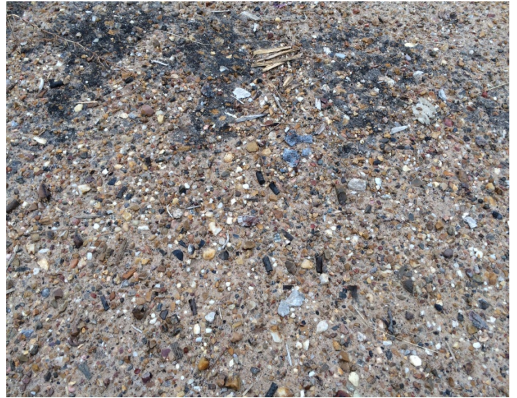
Photo 2: M6 Propellant scattered on the ground (after October 2012 explosion)