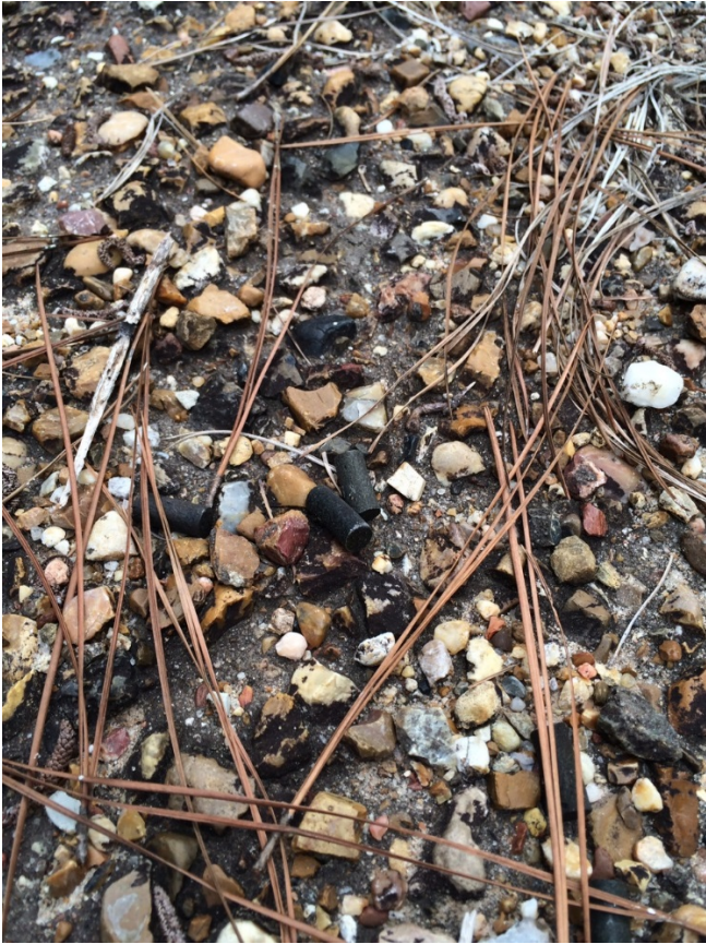
Photo 7: M6 Propellant spilled outside magazines exposed to elements