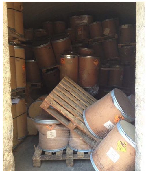
Photo 12: M6 and Tritonal/Aluminum/TNT containers falling and spilling contents inside magazines