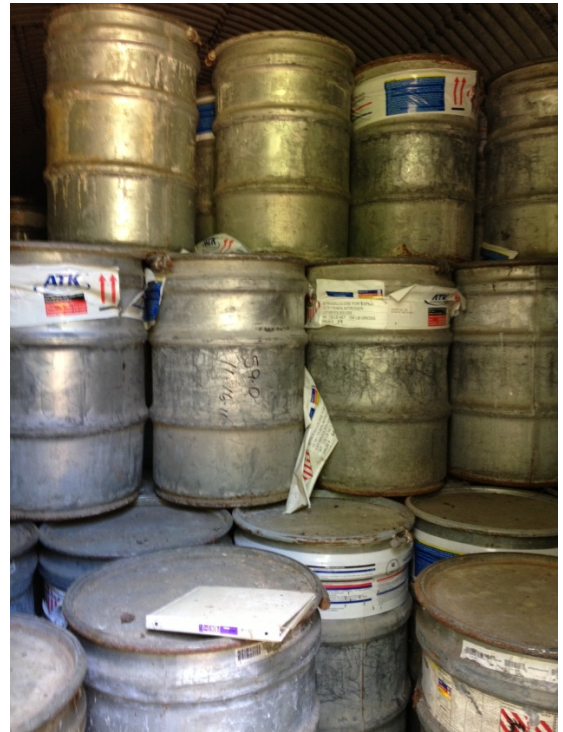
Photo 6: Nitrocellulose stored in explosive storage magazine at Camp Minden