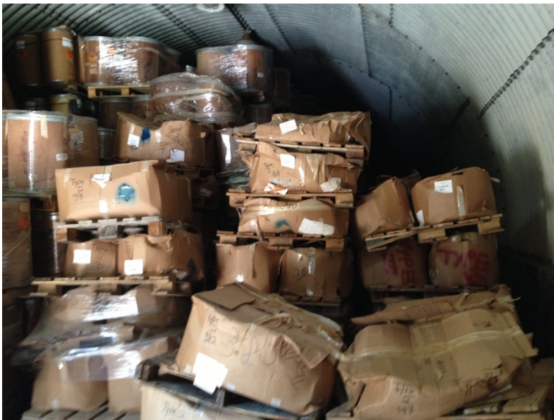
Photo 6: M6 propellant and Aluminum/TNT/Tritonal stored in explosive storage magazine at Camp Minden