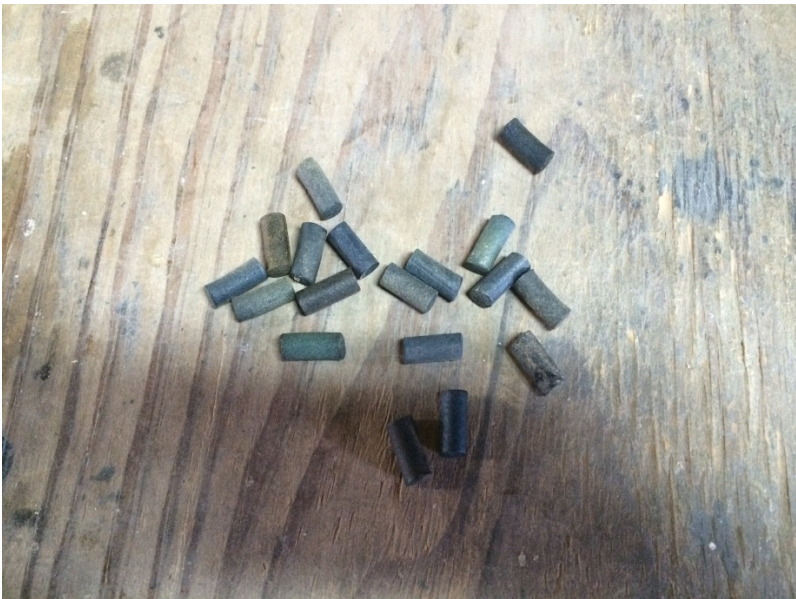
Photo 9: M6 propellant spilled on floor at S-Line (common throughout facility)