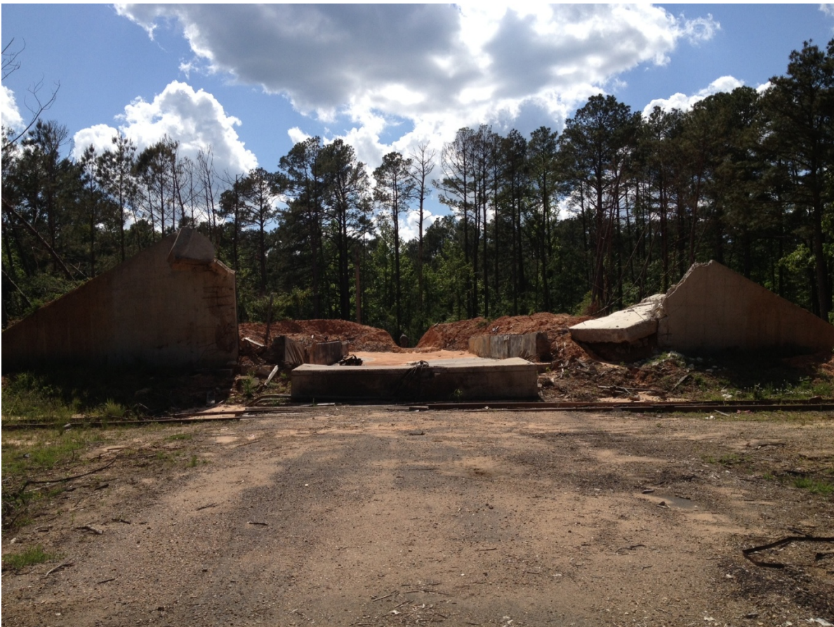
Photo 3: Result of explosion of magazine storing black powder and tractor trailers storing M6 Propellant in October 2012