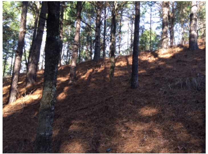
Photo 5: Trees growing on top of explosive storage magazine at Camp Minden