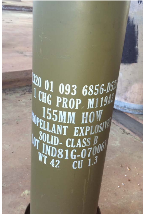
Photo 8: M119A2 155MM Propelling Charge provided to Explo by US Army for demilitarization; Origin of M6 Propellant