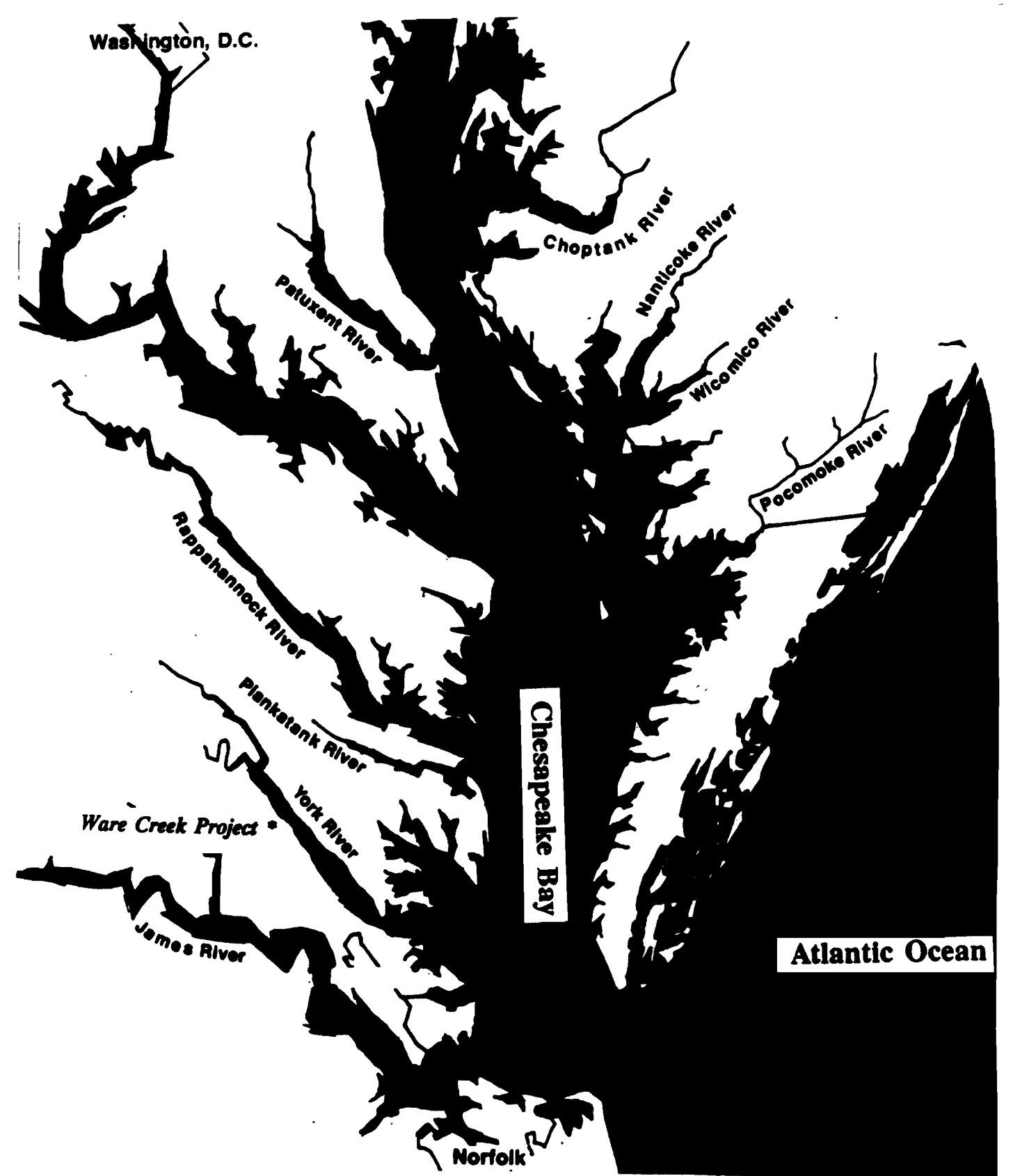
FIGURE 1. Location of Ware Creek project on a regional scale.