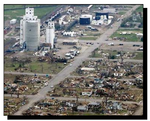
Greensburg, Kansas, devastated by an EF5 tornado, May 4, 2007

Hurricane Katrina, which devastated coastal areas of Louisiana and Mississippi in 2005, is another example of an event that generated significant interest in emergency planning. Better advance planning and preparedness could have improved emergency response, which likely would have minimized loss of life.