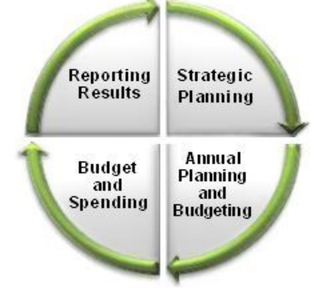
Figure 3, EPA Budget, Planning & Results Cycle

The management of EDSP's resource requirements and performance is conducted within the existing structure of the agency's budget, planning and results cycle.