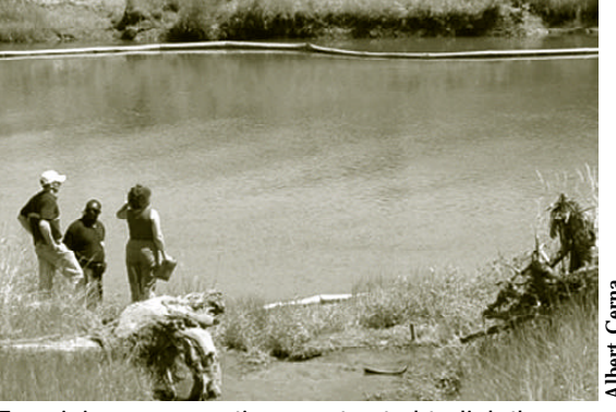
Examining a connection constructed to link the Columbia Slough and a new mitigation site during the 2003 Mitigation Stakeholder Forum held in Portland, Oregon.

Completing the actions in the Plan will enable the agencies and the public to make better decisions regarding where and how to restore, enhance, and protect wetlands; improve their ability to measure and evaluate the success of mitigation efforts; and expand the public's access to information on these wetland mitigation activities.