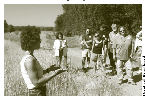
Discussing maintenance issues at a twoyear old mitigation site during the Portland Mitigation Stakeholder Forum.

formulation of the Action Plan. Additional forums were held in Portland, Oregon, in 2003, and Tampa, Florida, in 2004, to discuss progress on Action Plan tasks and solicit input on future Action Plan tasks. For a complete summary of the forums, visit <a href="https://www.mitigationactionplan.gov">www.mitigationactionplan.gov</a>. A future forum is scheduled to occur in 2005.