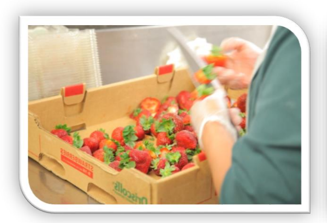
Figure 3. Identify locations on a facility tour which are generation points for food waste.

Definitions of the targeted wastes may be refined some after completing Step 2: The Pre-Assessment Questionnaire. For example, while completing the questionnaire you may learn that the compost hauler will not accept compostable plastics CPL#7. At which point you should revise your target waste definition and explore alternatives to compostable plastic that could be reused or recycled.