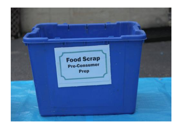
Figure 9. Label containers by the waste source and materials each will contain.

b) Sort waste on a table or on a large tarp on the ground. The number of tables used depends on the number of sorters. One table fits approximately four to six sorters. Place containers separated by waste category surrounding each table or across the tarp. The number of containers is based on the number of categories the waste will be separated into.