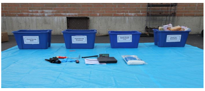
Figure 7. Place containers separated by waste category surrounding each table or across the tarp

The sorting area is designed around the inflow of waste to be sorted, and the outflow of the same waste after it is weighed. The following provides steps for setting up the sorting area.