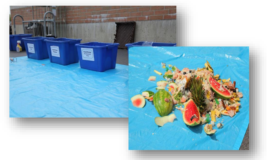
Figure 4. Set up sorting area by arranging tables with disposable table covers or a tarp on the ground. Arrange labeled bins for diverted material collection as planned (i.e. organics, metals, plastics, trash).