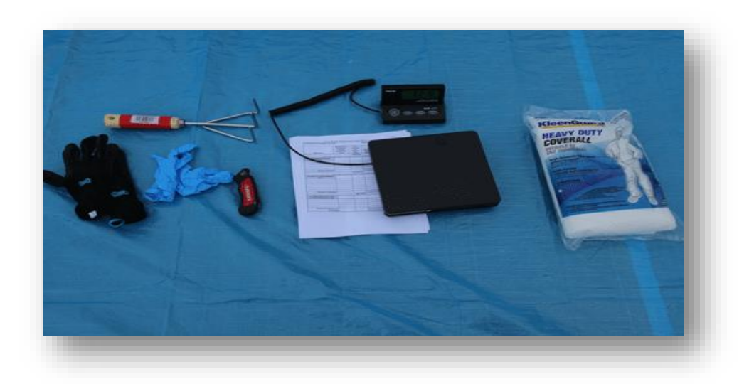
Figure 3. Supplies necessary to conduct the sort include a small portable scale, a small rake, tongs, and appropriate attire such as gloves and coveralls.