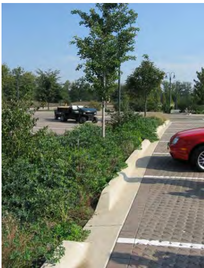
Parking lot bioswales and permeable pavers can help reduce the volume of stormwater runoff.

Option 1 (retaining the 95 th percentile rainfall event) is a performance-based, simplified approach that site designers can use to meet Section 438, while Option 2 (site-based hydrologic analysis) allows the site designer to conduct a hydrologic analysis of the site based on site-specific conditions.