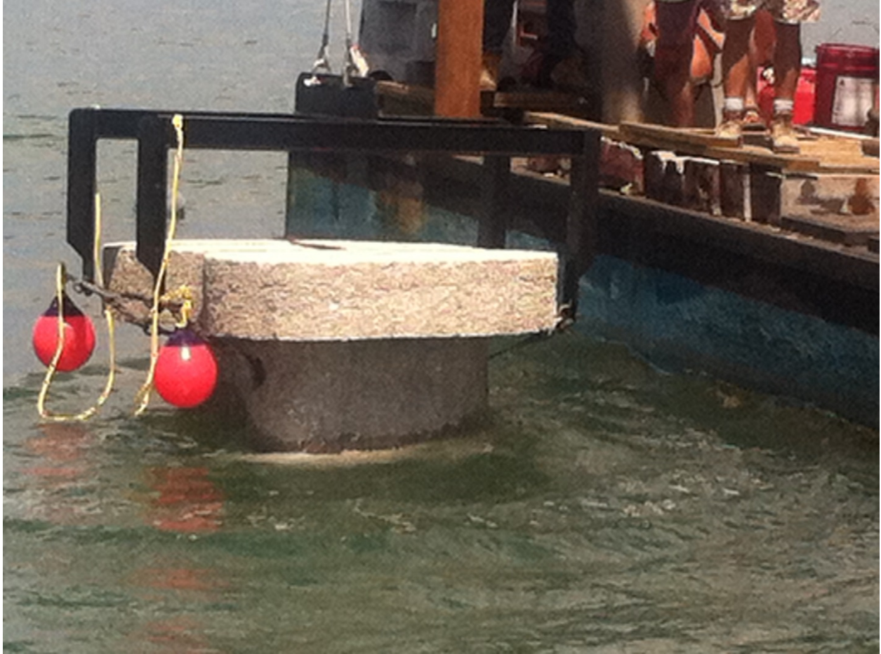
Figure 4. Deployment of "deep cover" module at one of the three Sarasota County artificial reefs in Sarasota Bay.