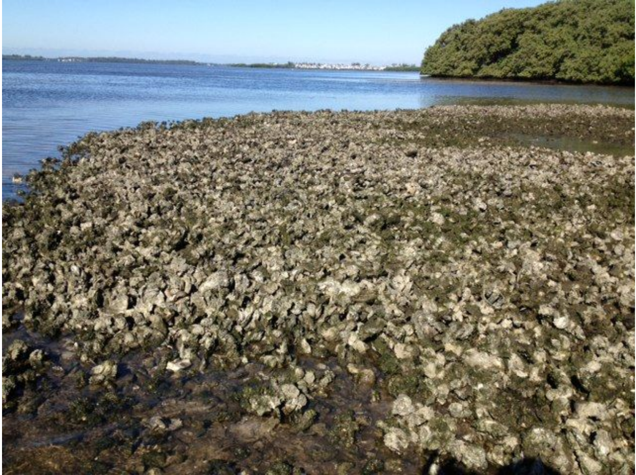
Figure 3. Created oyster reef in Sarasota Bay; three years after initial shell deployment.