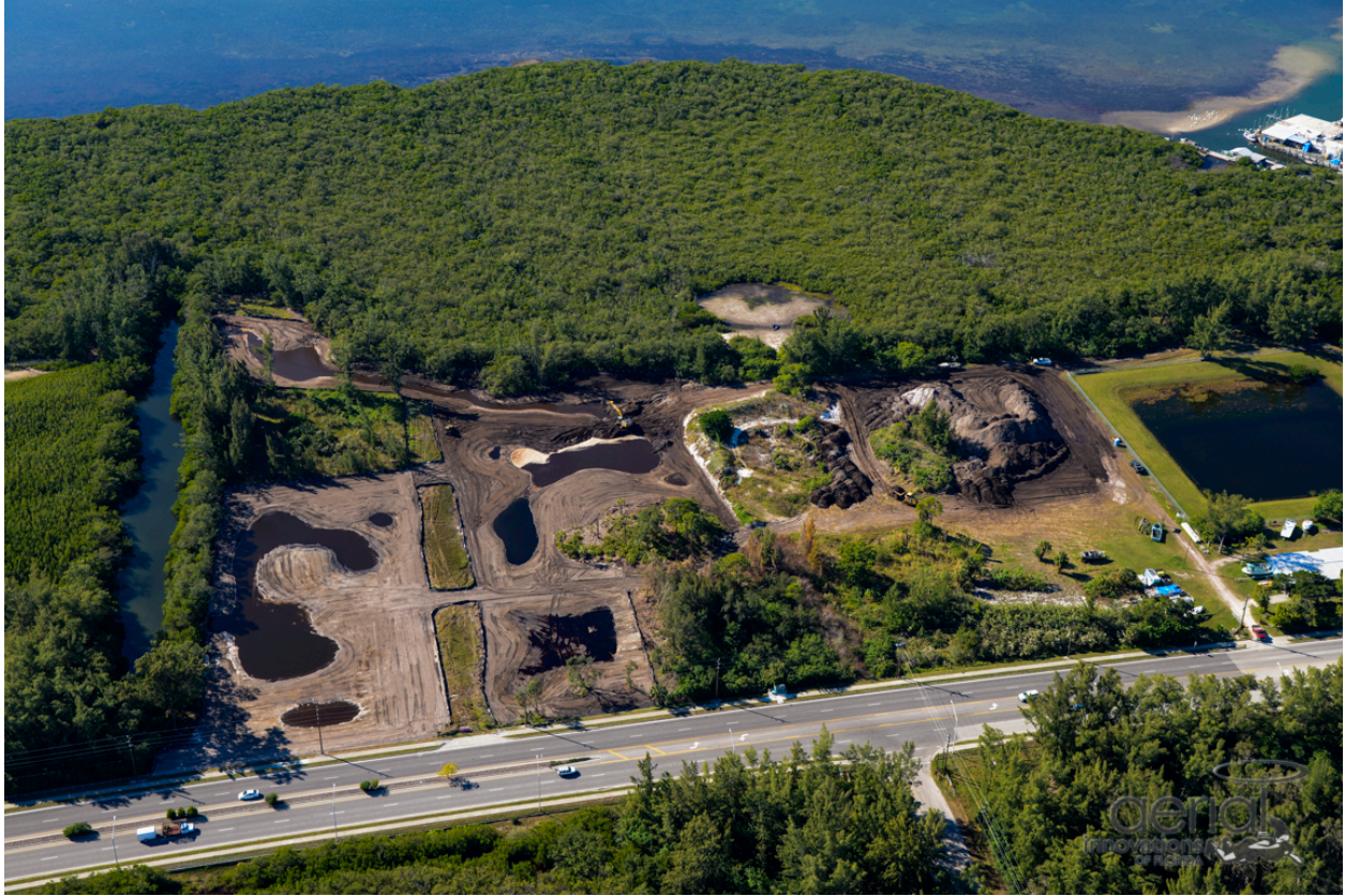
Figure 1. Aerial view of FISH Preserve after excavation and wetland creation.