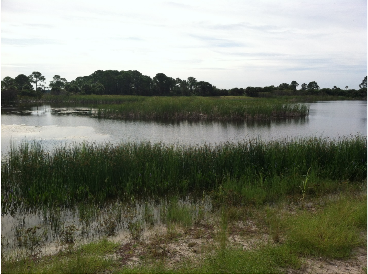
Figure 2. Shoreline and bird colony island restoration at Big Lake, Oscar Sherer Park in Osprey, FL.