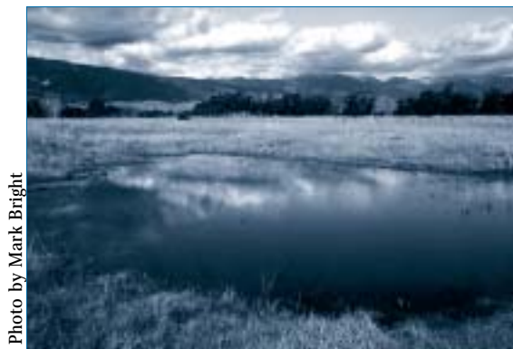
Vernal Pools are one of the most threatened ecosystems in the world.

In 1999, the Nature Conservancy (TNC), lead the way in using SRF loans from the California Water Resources Control Board to safeguard vernal pools. TNC paired an $8 million loan from the State with $6 million raised from private and public sources to add the stunning, 12,362-acre Howard Ranch to the Cosumnes River Preserve in South Sacramento County. The ranch was threatened with subdivision, and the purchase effectively prevented non-point source pollution and the degradation of water quality and habitat that would have resulted from development. The local Sacramento Valley Conservancy quickly followed suit by landing a $1 million SRF loan to advance the establishment of the 3,000 acre Sacramento Vernal Pool Prairie Preserve.